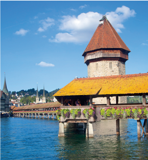
Lucerne’s beloved Kapellbrücke (Chapel Bridge)

Day 13: Salzburg/ Eagle’s Nest/ Berchtesgaden We travel today to the Bavarian resort town of Berchtesgaden, site of the clifftop Kehlsteinhaus (Eagle’s Nest), the Nazi Party’s alpine retreat, which we tour. In the event Eagle’s Nest is closed because of unseasonal weather, we’ll visit the nearby Berchtesgaden Salt Mine, which has operated continuously