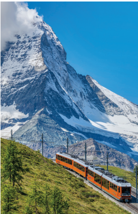
The Gornergratbahn open-air railway

Day 12: Salzburg Our walking tour this morning features the the 17 th -century Mirabell Gardens; the Baroque Old Town, now a UNESCO site; and visits to Salzburg Cathedral and medieval Hohensalzburg Fortress, one of Europe’s largest and best-preserved castles. This afternoon and evening are free for further exploration and lunch and dinner on our own. We have the opportunity to be in the city during the celebrated Salzburg Festival showcasing classical music and performing arts (no formal activities planned). B