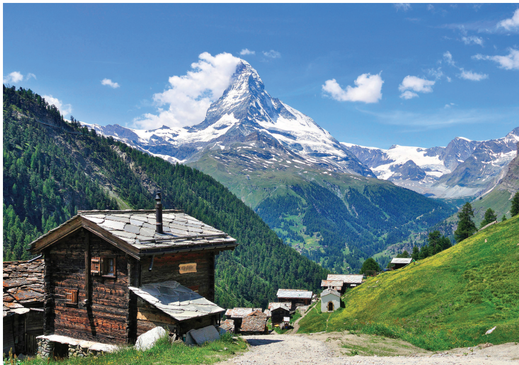
One of Europe's tallest peaks, the mighty Matterhorn presides over Zermatt.

Pass through the Alps. Late morning, we arrive in Stresa, Italy, along the shores of lovely Lake Maggiore, where we have time to explore and enjoy lunch on our own. Then a scenic drive through the famed Italian lake district returns us to Switzerland and our hotel in lakeside Lugano. B,D