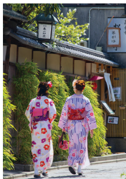
Geishas in traditional dress

Day 11: Kyoto More of Kyoto is on tap today, beginning with a visit to the otherworldly Arashiyama Bamboo Grove; the Kyoto Museum of Traditional Crafts (Fureaikan), showcasing all of Kyoto’s 74 different métiers in one place; and Nijo-jo Castle (c. 1603), the extravagant residence and fortifications of the shoguns who ruled Japan for more than 250 years. Then the remainder of the day is free for independent exploration in this traditional yet modern city. B