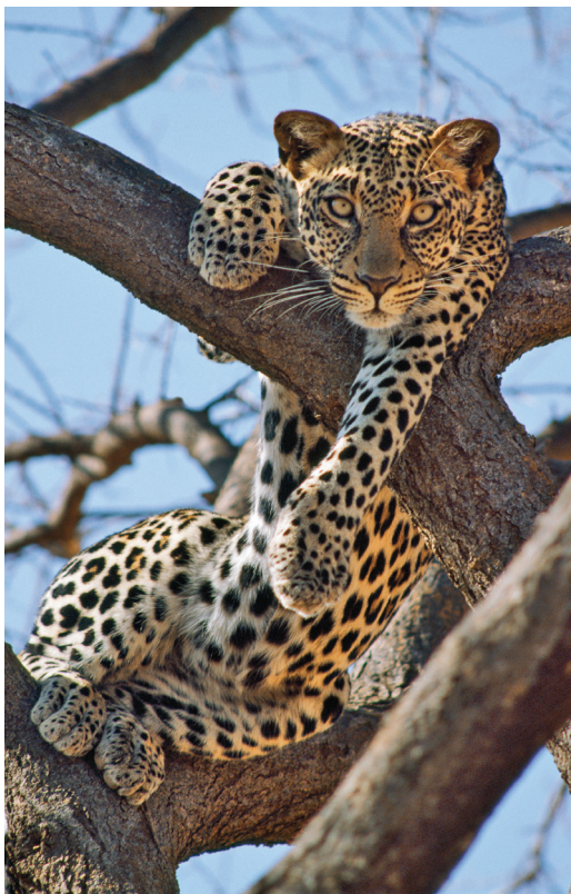
Getting comfortable ...