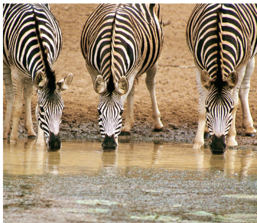
Zebra roam freely in Chobe National Park.

Day 14: Arrive U.S. We arrive in the U.S. this morning and connect with our flights home.