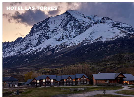
HOTEL LAS TORRES