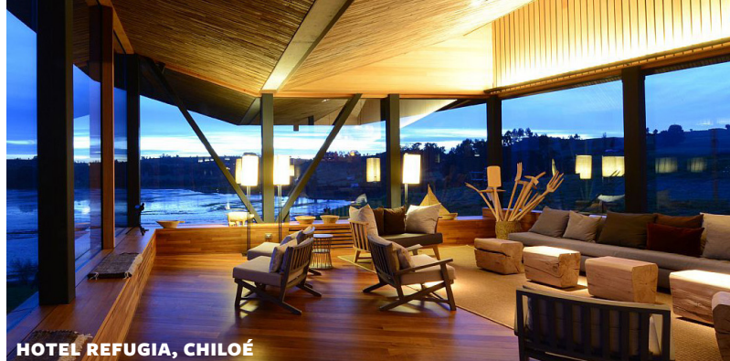
HOTEL REFUGIA, CHILOÉ