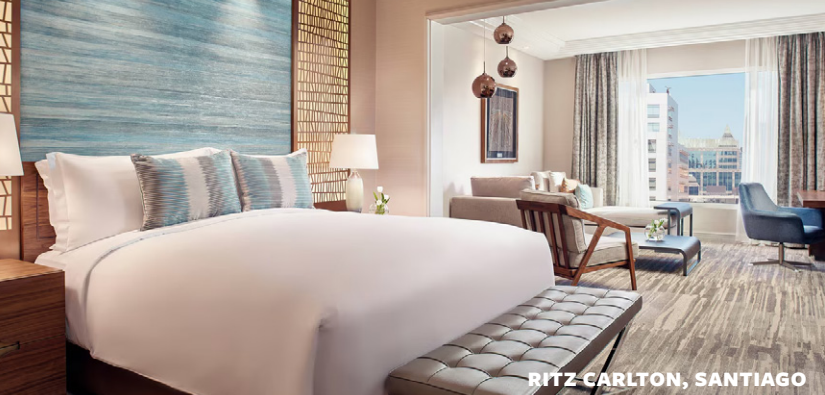
RITZ CARLTON, SANTIAGO