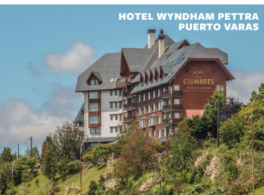
HOTEL WYNDHAM PETTRA PUERTO VARAS