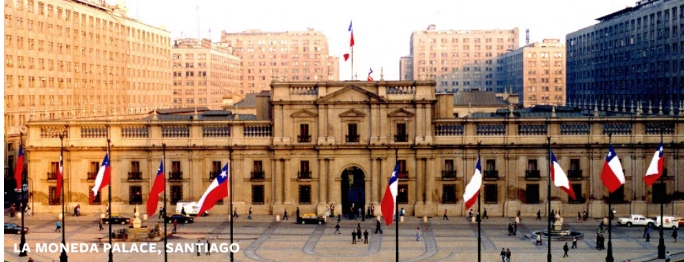
LA MONEDA PALACE, SANTIAGO