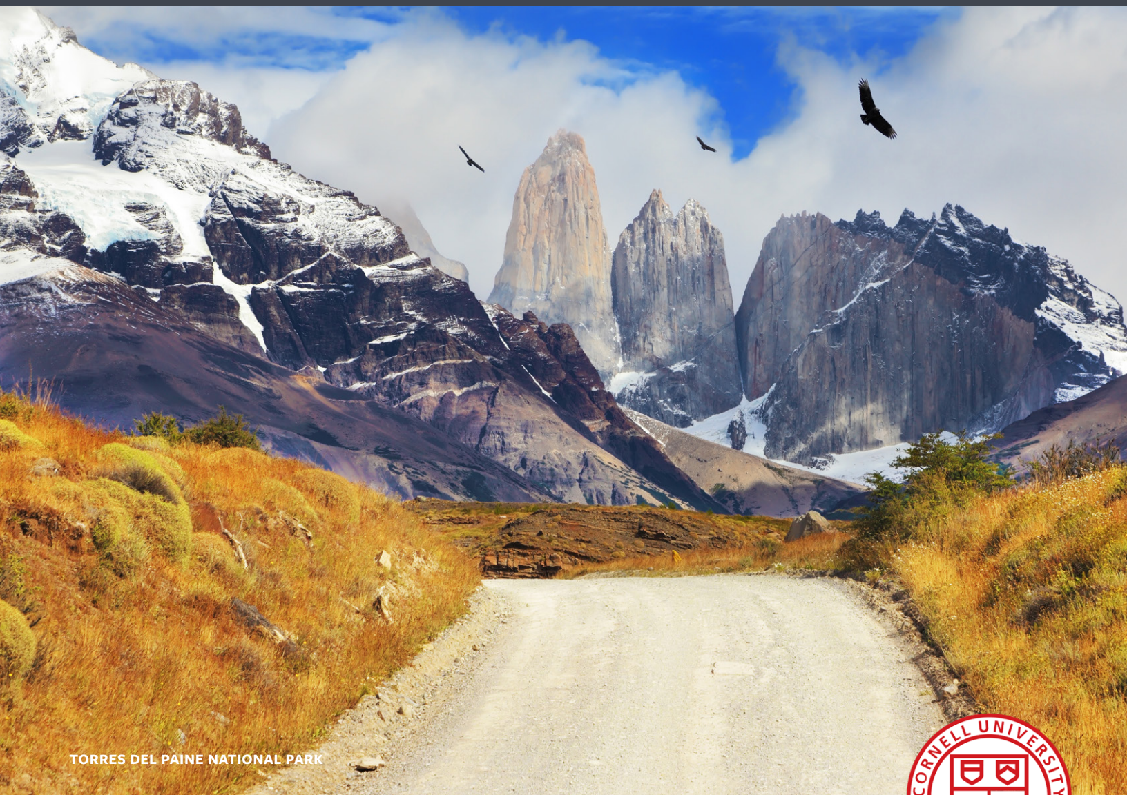
TORRES DEL PAINE NATIONAL PARK

MAJESTIC TORRES DEL PAINE —Spend three nights in Torres del Paine National Park, a UNESCO Biosphere Reserve, and home to towering granite spires, glaciers, and lakes, where you'll encounter diverse wildlife like guanacos, flamingos, and condors.