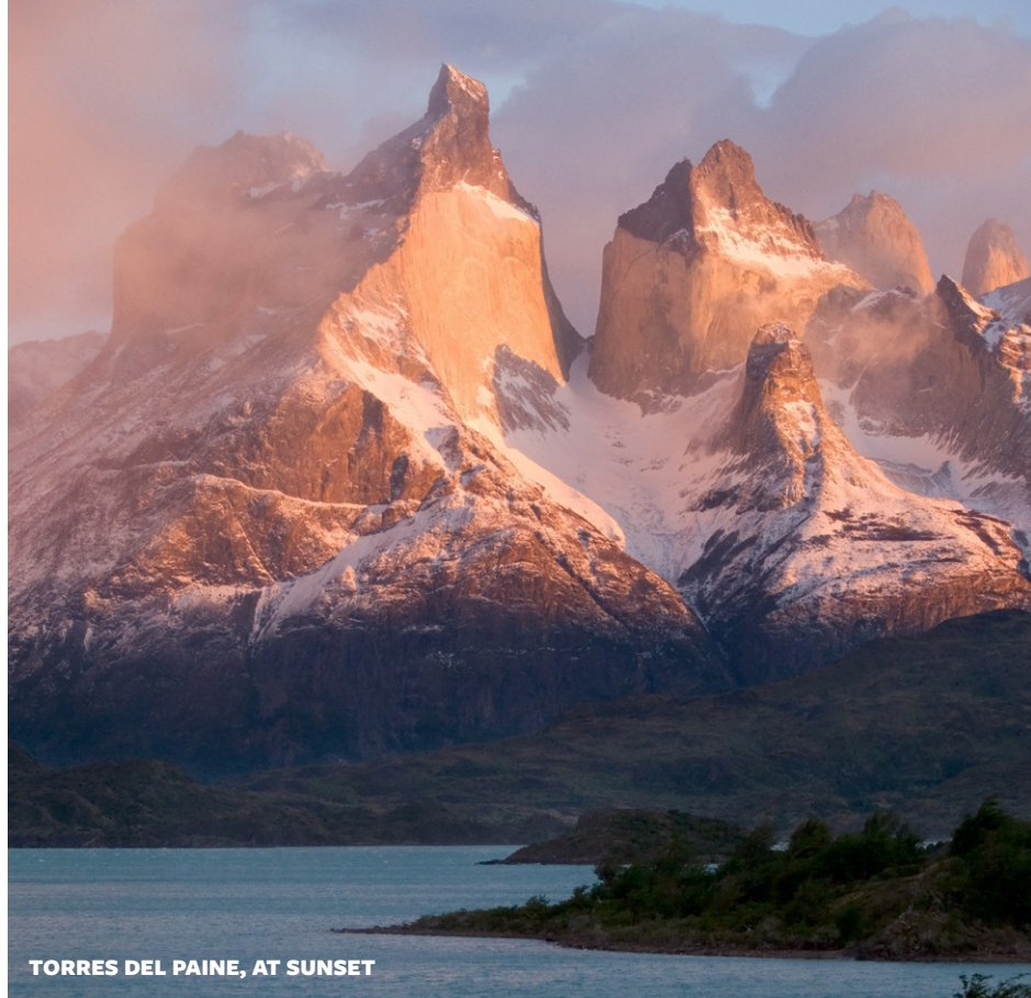
TORRES DEL PAINE, AT SUNSET

By far, the most impressive sight in southern Chile is Torres del Paine National Park, known as the crown jewel of Patagonia. It was declared a Biosphere Reserve by UNESCO in 1978. The dramatic mountain formations of towering rock, windswept pampas, ice fields, and glaciers, make it an impressive and unforgettable sight. We will explore the west side of the park one day and the east side of the park on another day. We look out for herds of guanacos and rheas, flamingos, condors, foxes, geese, and black-necked swans. Lakes and lagoons in hues of blues, greens, grays and ochres abound. The park is surrounded by impressive mountains including the famous Cuernos del Paine (Horns of Granite), twisted, snow-dusted pillars of grey granite that rise from the flat Patagonian plain. The spectacular Torres del Paine (Towers), giant granite peaks are even more spectacular. See Grey Glacier and lake with its blue iceberg, Salto Grande, a glacial waterfall set against majestic peaks, and many lakes. Hike or ride horses with an expert guide or simply relax in the surrounding wilderness. LAS TORRES (2B, 2L, 2D)