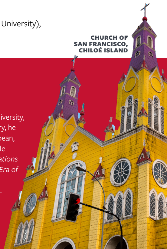
CHURCH OF SAN FRANCISCO, CHILOÉ ISLAND