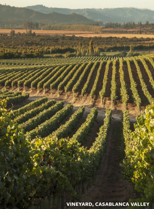
VINEYARD, CASABLANCA VALLEY