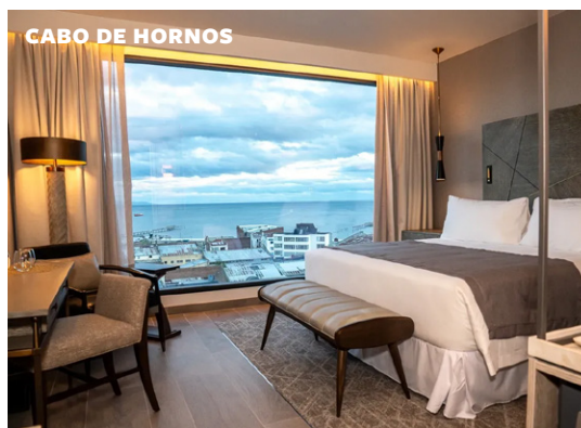
CABO DE HORNO