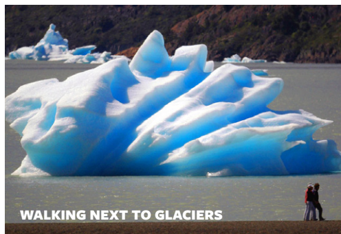
WALKING NEXT TO GLACIERS