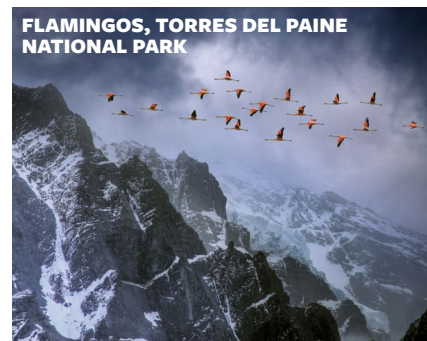
FLAMINGOS, TORRES DEL PAINE NATIONAL PARK