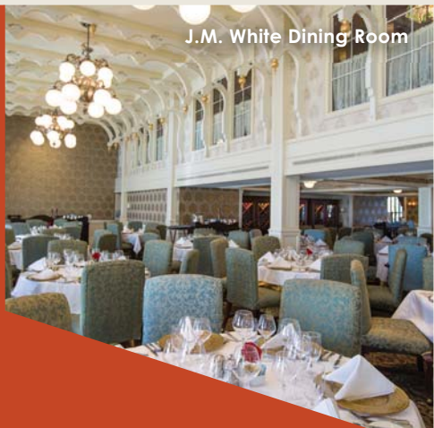
J.M. White Dining Room

Creating plates inspired by culinary classics of America’s South and utilizing the best of the season’s offerings from stops along the way, an award-winning culinary team lends its expertise to the unique dining experience on the American Queen . Indulge in the elegance of the J.M. White Dining Room, or satisfy your appetite any hour of the day at the Front Porch Café as you sample delectable creations, from pork loin stuffed with andouille sausage to corn fritters and bourbon pecan pie.