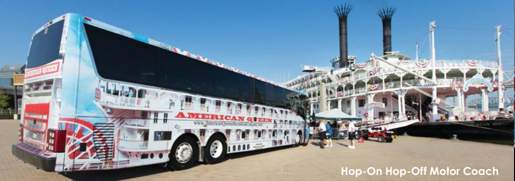
Hop-On Hop-Off Motor Coach