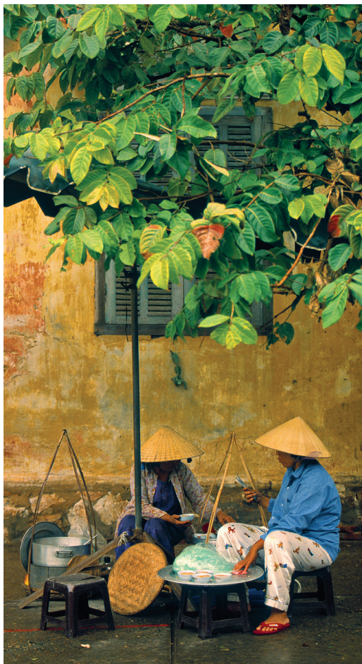
Hoi An vendors