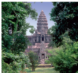
Temple at Angkor Wat, Cambodia

Day 14: Mekong Delta/Saigon Today we travel by coach to Saigon, arriving in time for lunch at a local restaurant. Our afternoon tour includes the