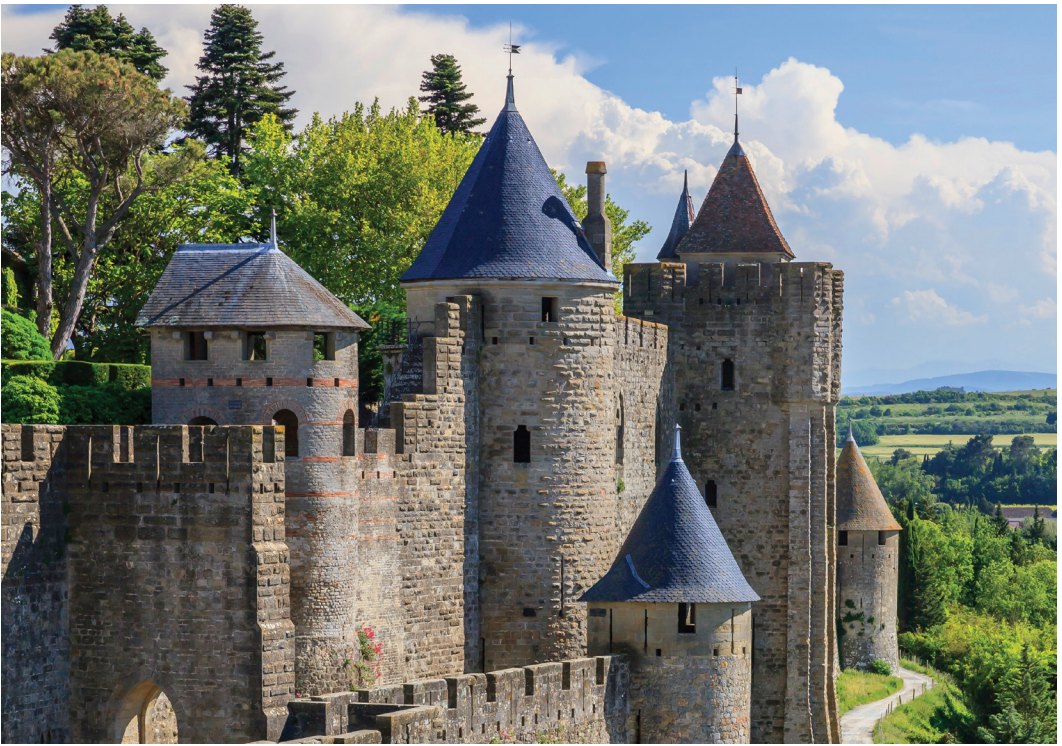
We tour the walled citadel of Carcassonne on Day 4.

Day 6: Perpignan/Collioure We travel this morning to Collioure, France, the “City of Painters” immortalized by such artists as Dérain, Matisse, and Picasso, among other Fauvists, the “anti-Impressionists” who emphasized strong, bold color in their work. After an orientation tour, we are free to discover this charming town as we wish. Collioure boasts an impressive castle, Chateau de Collioure; photogenic medieval streets; and a picturesque harbor. B,D