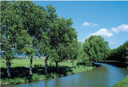
We cruise along Canal du Midi on Day 4.

Day 13: Depart for U.S. This morning we transfer to the Marseille airport for our connecting flights to the U.S. B