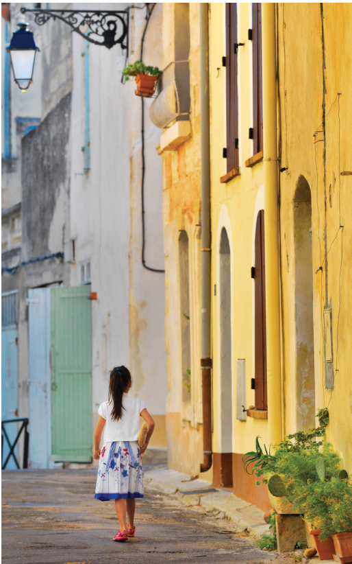
Bringing home the baguette