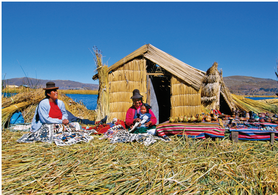
Uros Islands residents on Lake Titicaca

World Heritage site. Mid-afternoon we return to Aguas Calientes and our hotel, with time at leisure before dinner together tonight. B,L,D