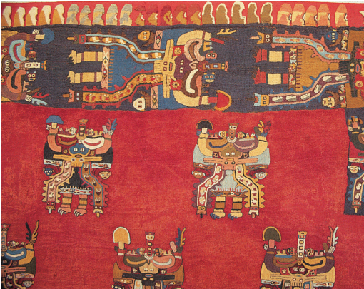
Traditional Peruvian fabric

Day 11: Arrive U.S. We arrive in the U.S. this morning and connect with our flight home.