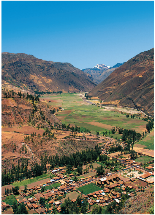
The beautiful and historic Sacred Valley