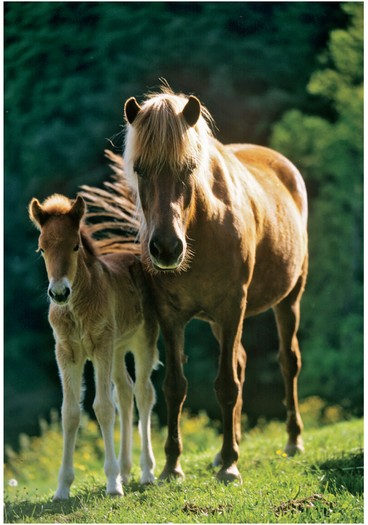
On Day 4 we visit a farm featuring famed Icelandic horses.