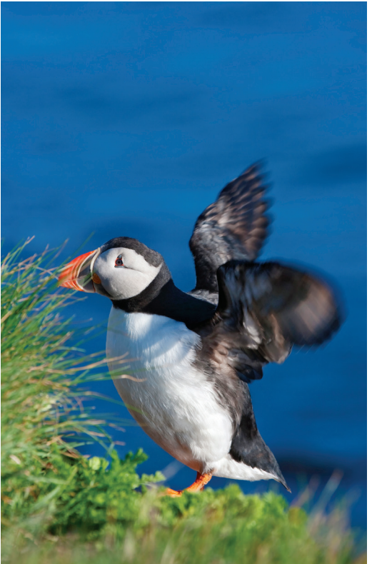
Iceland boasts 8 to 10 million puffins.

Day 8: Selfoss/Vik This morning we walk along the black-sand beach at Reynisfjara, lined with columnar basalt-filled caves. Next we visit picturesque