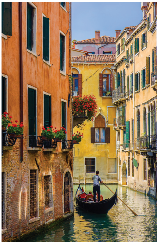
Our tour ends in timeless Venice.

Day 15: Venice This morning we take a guided walk through St. Mark’s Square and surroundings. Our afternoon