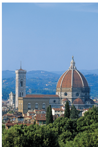
We visit splendid Florence on Day 12.

Day 13: San Gimignano We encounter classic Tuscany today as we visit the hill town of San Gimignano, known for the 13 watchtowers that have left its skyline virtually unchanged since medieval times. Later we visit a local winery and enjoy a tasting before returning to our lodgings mid-afternoon. B,D