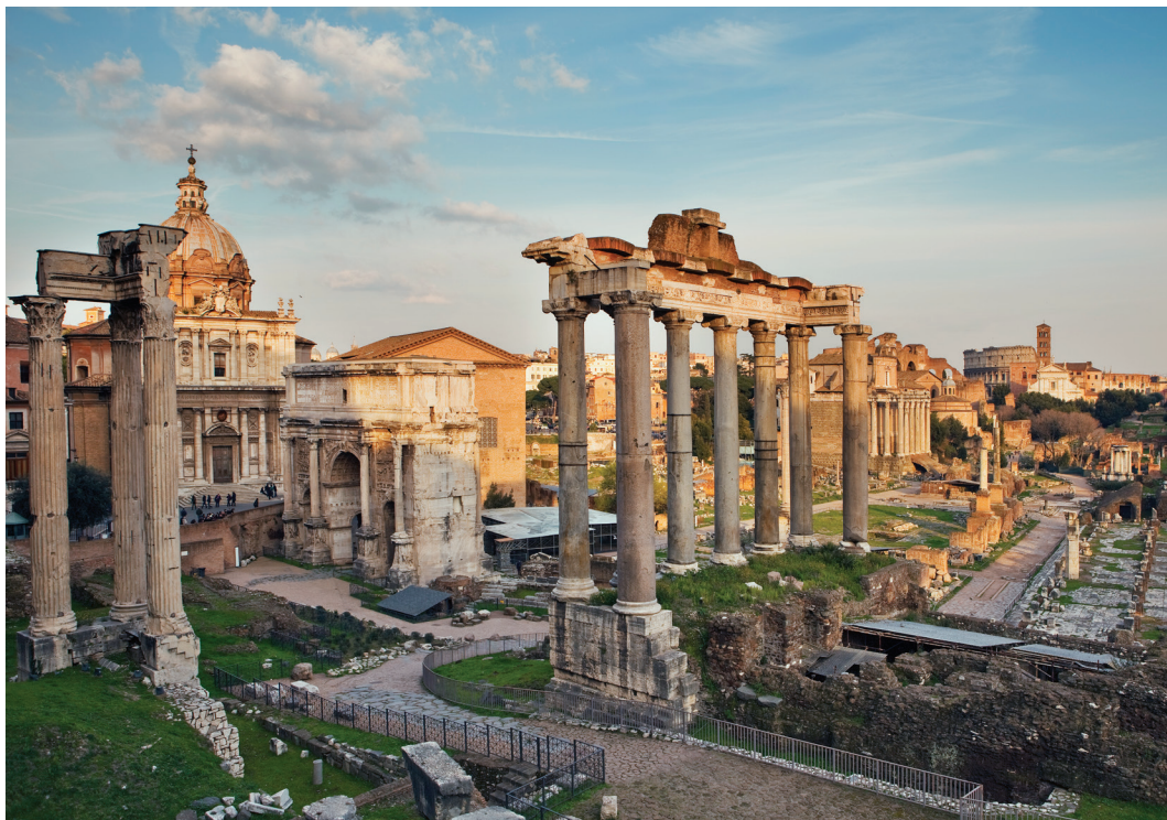
Rome's forum dates to the 7 th century BCE.

Day 7: Rome Today we visit the Vatican for a tour of St. Peter's Square and Basilica, and the Sistine Chapel in the Vatican Museums. Highlights include Michelangelo's "Pieta" in St. Peter's, considered one of the greatest sculptures of all time; his frescoed ceiling of the Sistine Chapel, now restored to its original glory; and art-filled St. Peter's itself, the most important church in all Christendom. B