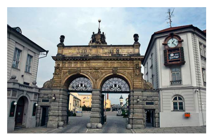
The great gate leading in to the Pilsner Urquell brewery complex.