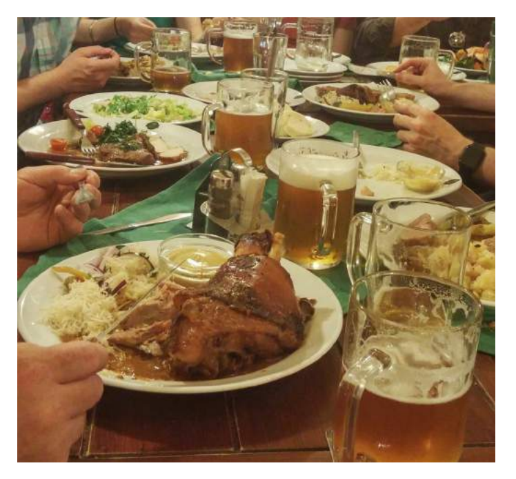
At Na Parkanu a Czech feast includes hearty dishes like a whole roasted pork knuckle, seared duck breast, potato pancakes, and bread dumplings...