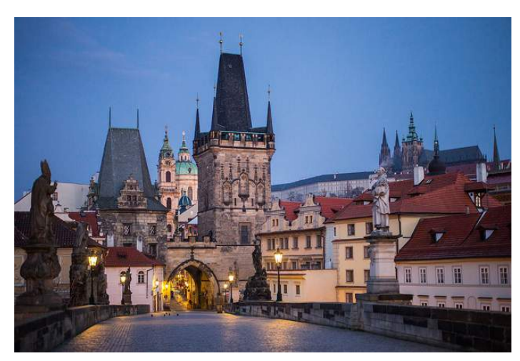
Prepare to fall in love with the absolutely enchanting city of Prague.