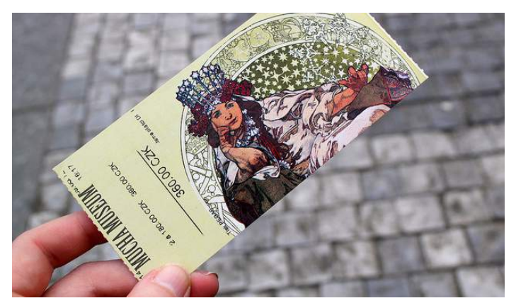
As a longtime epicenter of art & literature, you can immerse yourself in excellent museums dedicated to some of Prague's most creative former residents: explore the legacy of the star of Art Nouveau, Alphonse Mucha, or delve into the bizarre world of 20th century literary legend Franz Kafka.