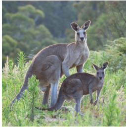
We may see kangaroo at Featherdale Wildlife Park.

Day 18: Queenstown/Rotorua We depart today for the Maori center of Rotorua, with its geysers, bubbling mud pools, and hot thermal springs. Our tour