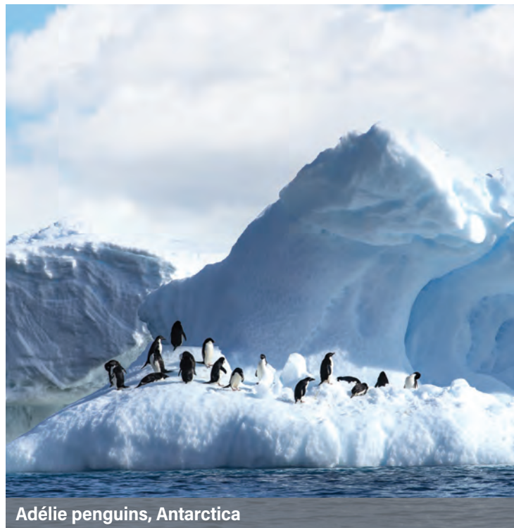
Adélie penguins, Antarctica

presidential palace, and other sites. On the evening of January 12th, gather at the hotel for a reception and briefing to prepare for tomorrow's flight to Ushuaia and embarkation on Vega . (B)