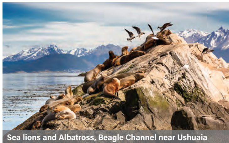
Sea lions and Albatross, Beagle Channel near Ushuaia

Attend lectures and briefings on what lies ahead and enjoy the ship's facilities as Vega navigates the Drake Passage to Antarctica. Keep a lookout for the albatrosses, Cape petrels, and whales