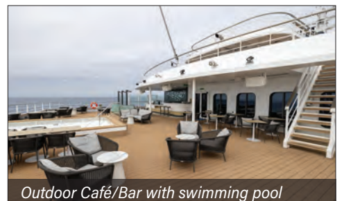
Outdoor Café/Bar with swimming pool

Built in Finland and launched in July 2022, Swan Hellenic's Vega is a new-generation expedition cruise ship. Although at 10,250 tons the ship is large enough to accommodate more than 250 passengers, Vega will accommodate a maximum of 152 guests in 76 spacious staterooms and balcony suites. The low guest density results in one of the most generous indoor and outdoor space-to-guest ratios among cruise ships.