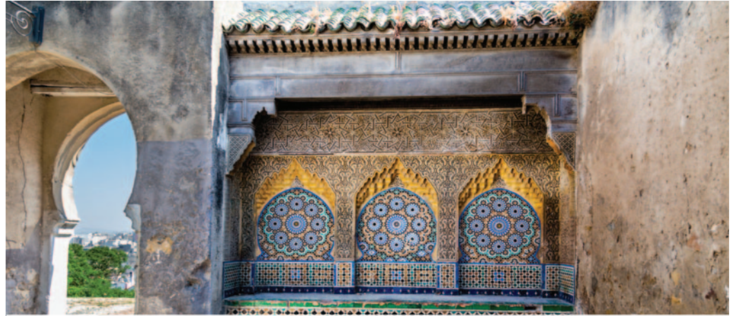
Tangier's traditional architecture

After breakfast aboard, disembark and transfer to the airport for flights homeward. (B)