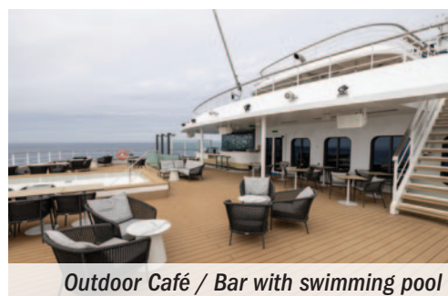
Outdoor Café / Bar with swimming pool

Currently under construction in Finland and launching in early March 2023, Swan Hellenic's Diana is a new-generation expedition cruise ship. Although at 12,100 tons the ship is large enough to accommodate more than 350 passengers, Diana will accommodate a maximum of 192 guests in 96 spacious staterooms and balcony suites. The low guest density results in one of the most generous indoor and outdoor space-to-guest ratios among cruise ships.