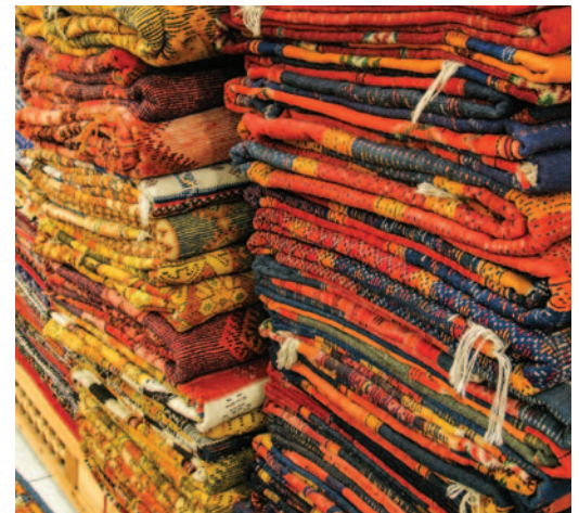
Rug Market, Tangier