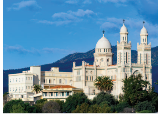
Basilica of Saint Augustin, Annaba, Algeria