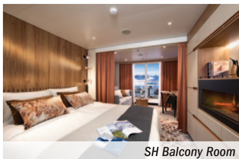
SH Balcony Room