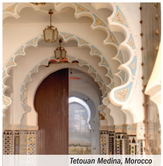
Tetouan Medina, Morocco