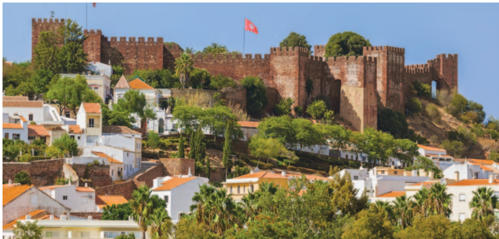
Portugal's attractive town of Silves is dominated by its castle