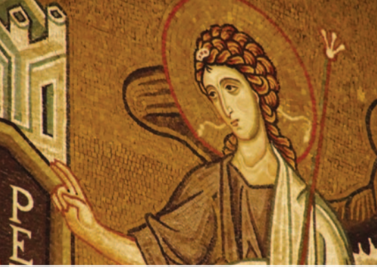
Detail of mosaic in Capella Palatina, Palermo