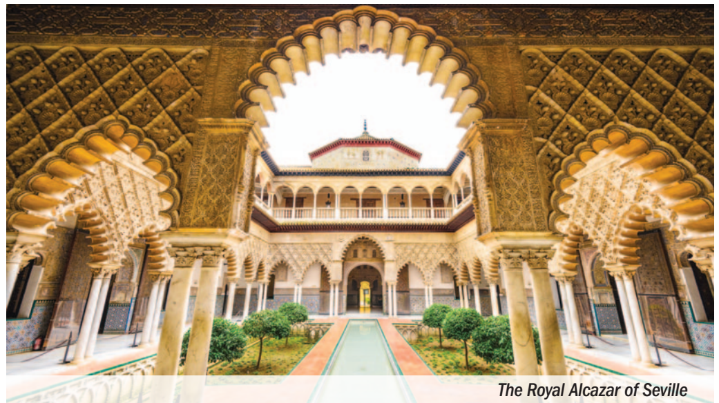
The Royal Alcazar of Seville