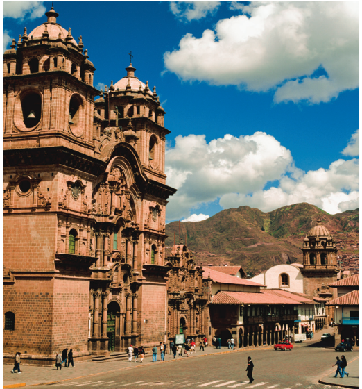
Plaza de Armas, Cuzco

Day 11: Arrive U.S. We arrive in the U.S. this morning and connect with our return flight home.