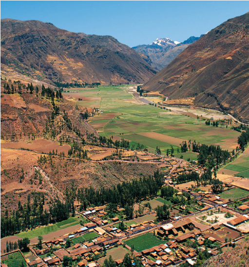
The beautiful and historic Sacred Valley

Day 10: Puno/Lima/Depart for U.S. This morning we visit the mysterious burial towers ( chullpas ) at Sillustani over-looking Lake Umayo. After lunch we transfer to the airport for the flight to Lima, where we check into our day rooms at an airport hotel. Late this evening we depart on our flight to the U.S. B,L