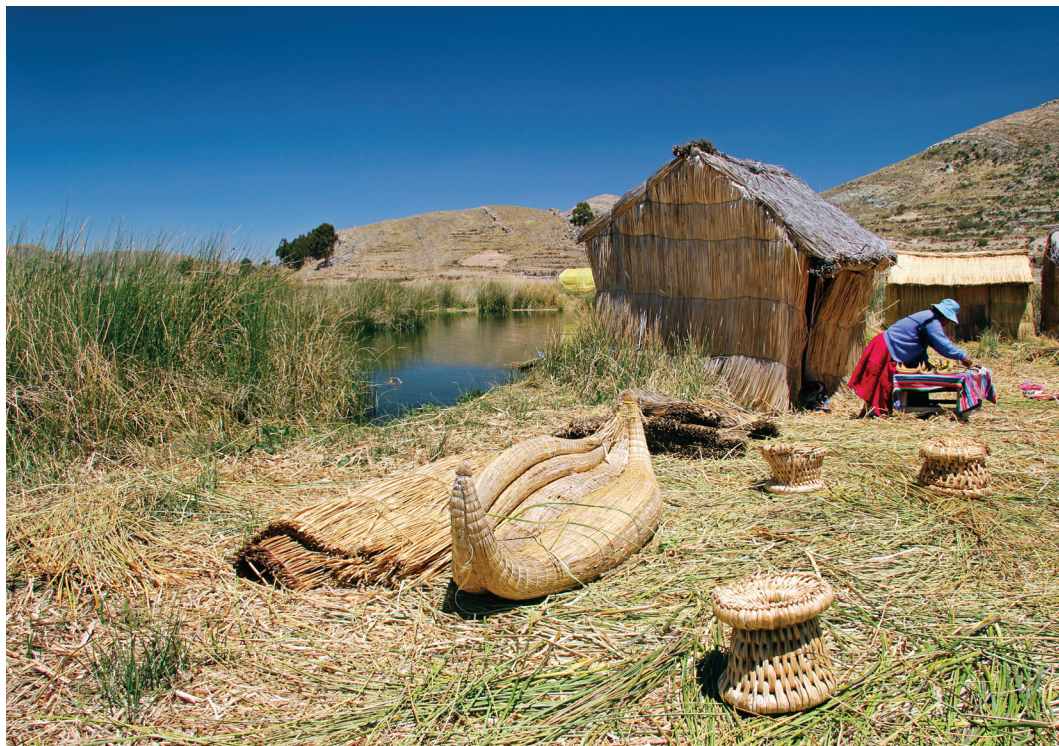
Local woman at work on Uros Island

Aguas Calientes and our hotel, with time at leisure before dinner together tonight. B,L,D