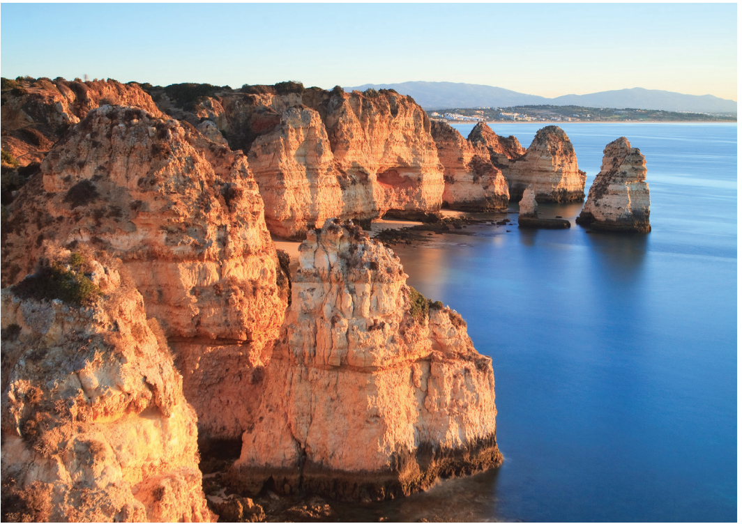
We see the Ponta da Piedade rock formations on Day 11.

and as the home of port wine. Highlights of our panoramic city tour include the medieval city center, a UNESCO site, and the baroque Clérigos Church, with its signature bell tower. Then we enjoy a private “six-bridge” cruise on the Douro, upon whose banks the Romans planted grape vines millennia ago. Our tour ends with a visit to a port lodge for a tasting of the fortified wine exclusive to this region. The remainder of the day is free to enjoy this fascinating city as we wish, perhaps to wander the narrow cobbled streets of the medieval Ribeira (riverside) district – or to stroll the broad boulevard and public square of Praça da Liberdade, flanked by imposing civic buildings and trendy boutiques. We dine together tonight. B,D