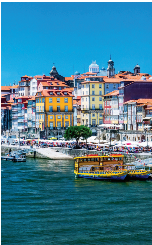
Oporto on the Douro River

Day 13: Depart for U.S. We transfer to the airport this morning for our connecting flights to the U.S. B