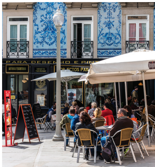
Café life in Portugal