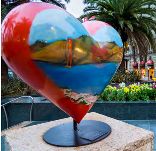
The heart of San Francisco – Union Square