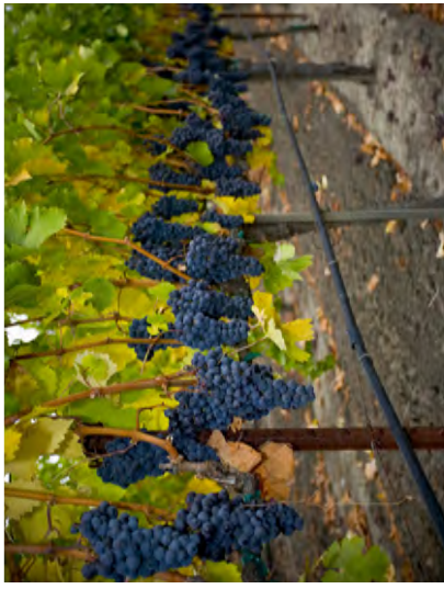
Classic Escapes protects our planet. ♻️