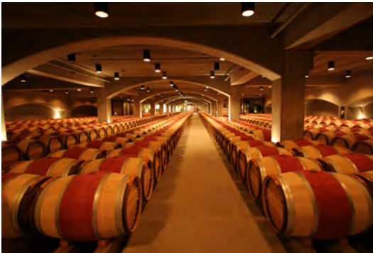
Carefully maintained vintages, aging in a cellar