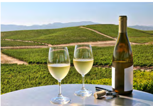
Wine tasting among the hills of Napa Valley

“San Franciscans are very proud of their city, and they should be. It’s the most beautiful place in the world.”