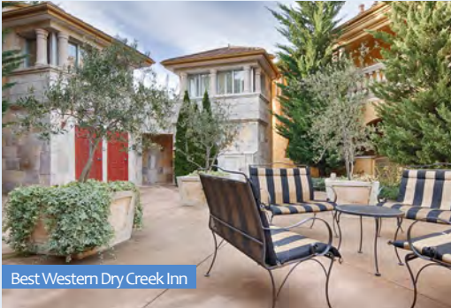
Best Western Dry Creek Inn