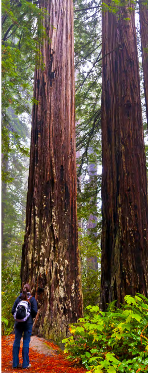
Hiking through Redwood State Park