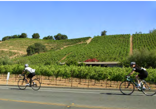
Cycling around Healsburg