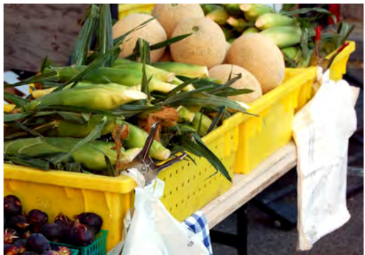
The bounty of farmers markets in Healdsburg

Bid farewell to California. While you might be heading back home, you'll take with you all you've learned and experienced here.