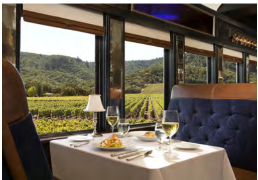
Inside the Napa Valley Wine Trail train