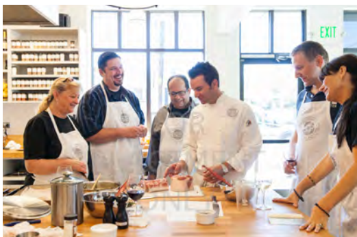
Enjoying a class at the Silverado Cooking School