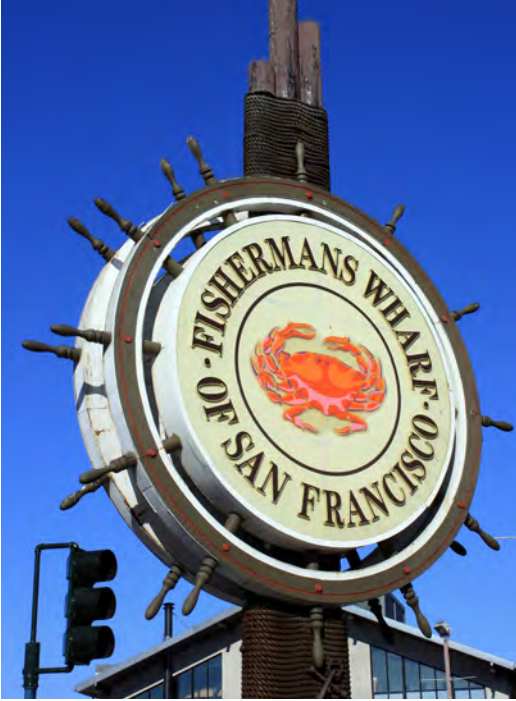
The World-Famous Fisherman's Wharf

Hotel Spero: Recently renovated, Hotel Spero has maintained the rich historical aspects of the original hotel design, with unique elements that are true to the soul and spirit of San Francisco.