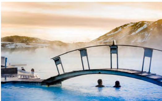
A couple enjoys a soak in the Blue Lagoon

“In Iceland, you can see the contours of the mountains wherever you go, and the swell of the hills, and always beyond that the horizon. And there’s this strange thing: you’re never sort of hidden; you always feel exposed in that landscape. But it makes it very beautiful as well.”