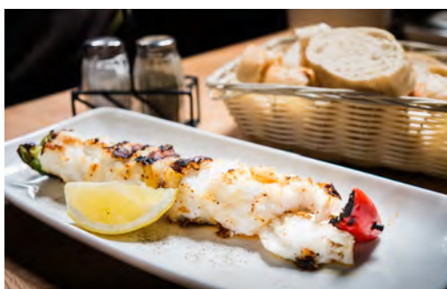
Savory Icelandic cuisine – Cod with lemon