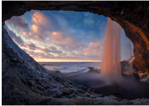
Walk behind Seljalandsfoss waterfall for incredible photos

Enjoy some time at leisure to discover Reykjavik's sites this morning. In the afternoon bid Iceland bless (goodbye) as it is sadly time to return home.