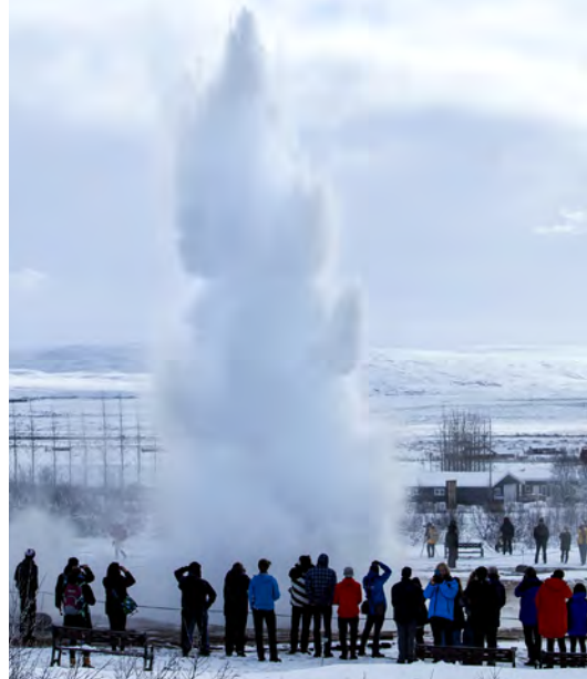
Viewing Strokkur, the most active geyser