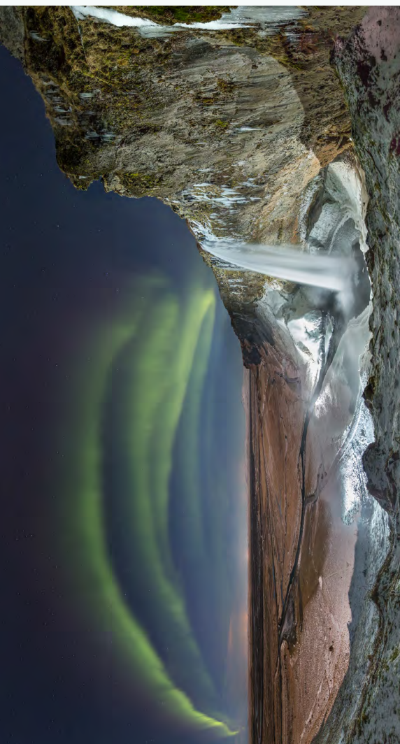
Classic Escapes protects our planet. ♻️