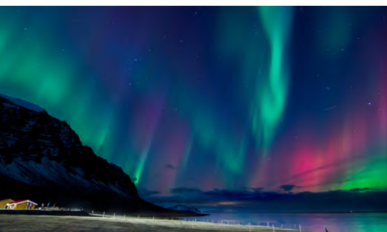
Aurora over the ocean coast

This ancient compass symbol is a vegvisir, a magical rune from ancient Iceland meant to protect travelers. Famous Icelandic Bjork has one as a tattoo.