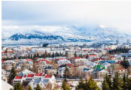
The winter landscape of Reykjavik