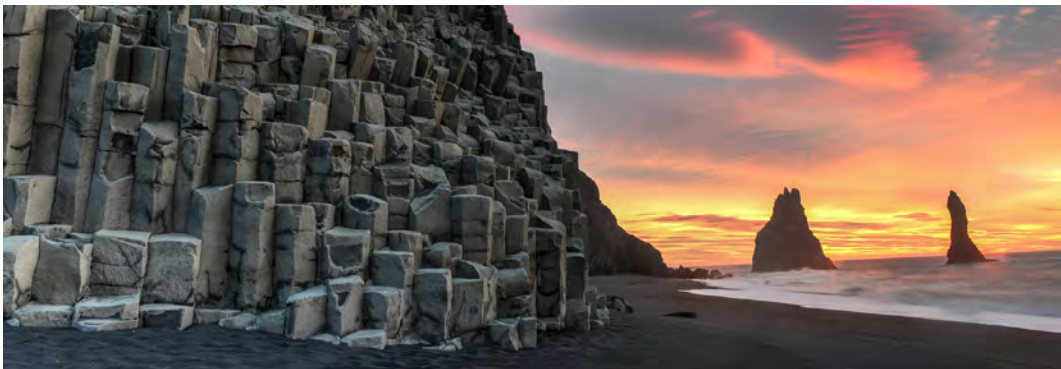
Reynisfjara beach with rock formations and columnar basalt