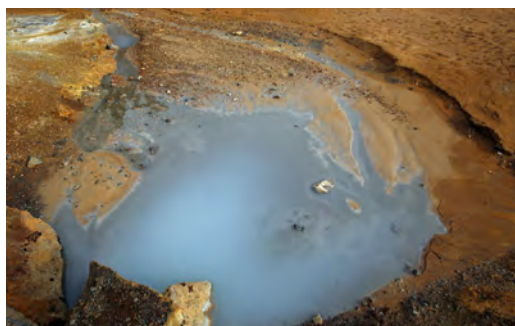
A look into the Krýsuvík geothermal area