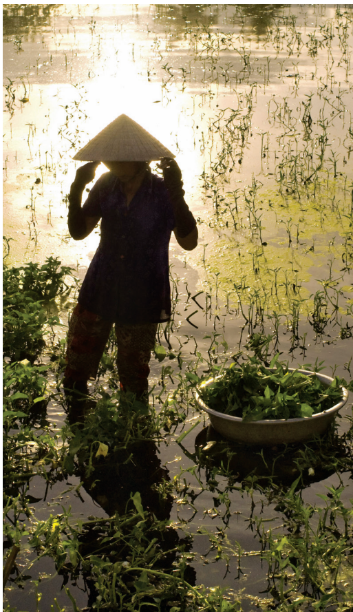
A Vietnamese farmer plants rice.