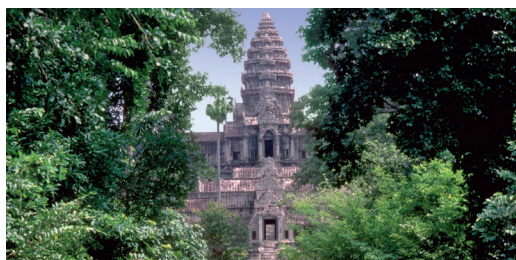
Temple at Angkor Wat, Cambodia

Day 17: Arrive U.S. We arrive in the U.S. and connect with our flights home.