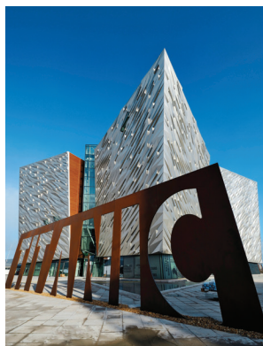
Titanic Museum, optional extension

Day 11: Kilkenny Today is devoted to Kilkenny, a well-preserved medieval city. We tour 12 th -century Kilkenny Castle, considered one of the country’s most beautiful, then embark on an informal walking tour of Kilkenny itself, noting the many buildings of “black” or Kilkenny marble, quarried locally. After lunch together at a local pub, the remainder of the day is at leisure. B,L