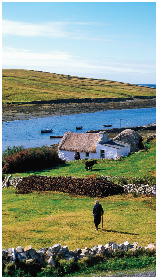
Stone walls wind through the Aran Islands.