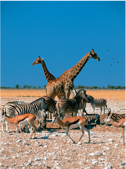
Tarangire National Park teems with diverse wildlife.

Day 10: Serengeti We embark on more game drives today. We have the chance to see some – or all – of Africa’s “Big Five:” lion, Cape buffalo, elephant, rhino, and leopard, along with wildebeest, zebra, eland, gazelle, and other plains animals, and some 500 species of birds. B,L,D