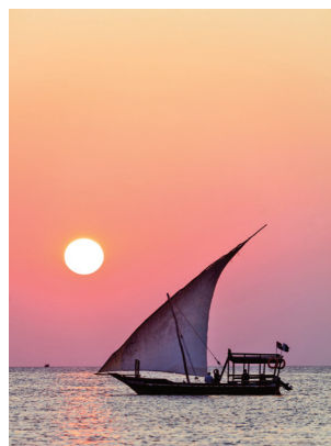
Traditional dhow sails off Zanzibar.

Day 12: Zanzibar A morning tour of a spice plantation reveals why Zanzibar is known as the “Spice Island” – its bounty of cloves, nutmeg, ginger, chilies, black pepper, vanilla, coriander, and cinnamon have