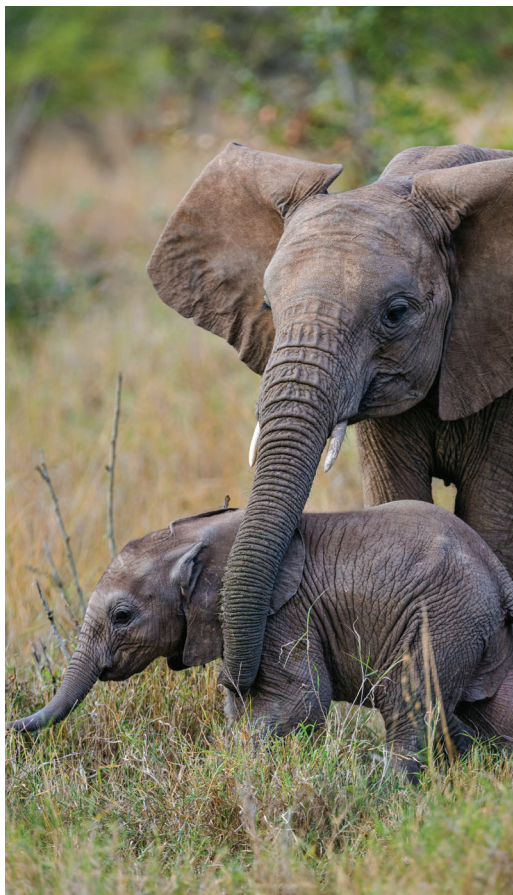
Learning the ropes ...