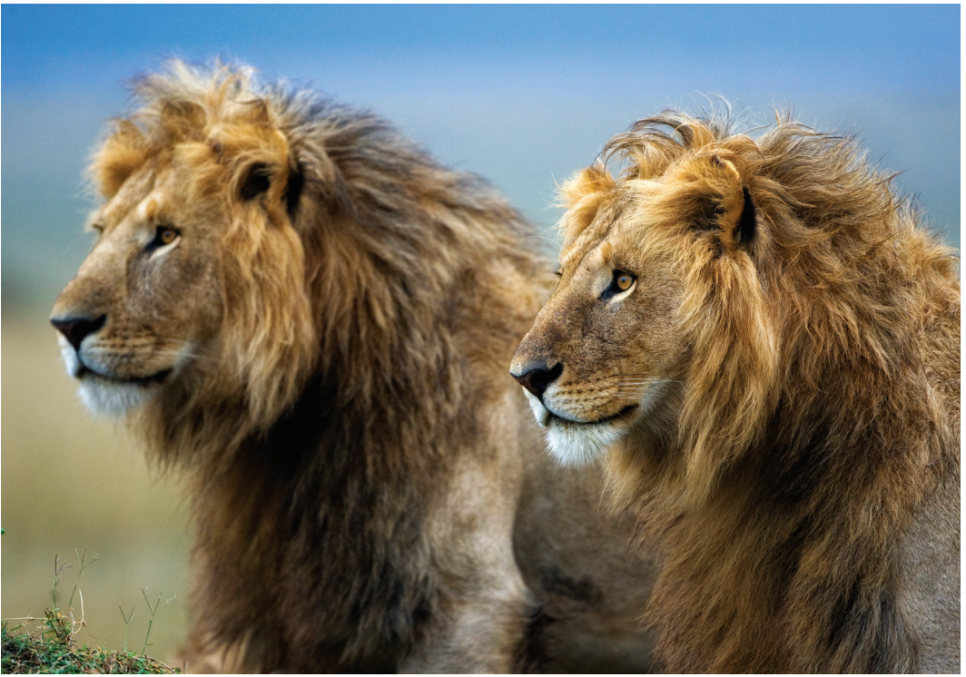
More than 3,000 lions roam the Serengeti.

Day 7: Ngorongoro Crater This morning we descend to the floor of magnificent Ngorongoro Crater, a UNESCO site and at 100 square miles, the world’s largest intact and perfectly formed volcanic caldera. The unique biosphere here has remained unchanged for eons; towering walls encircle the crater’s floor which represents Africa in microcosm: grassland, swamps, lakes, forests, and some 25,000 mammals, including elephant, black rhinoceros, lion, hippo, and zebra. Then we return to our lodge for an afternoon at leisure. B,L,D