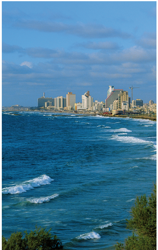
Sophisticated seaside Tel Aviv

Day 12: Depart Tel Aviv for U.S. Very early this morning we transfer by motorcoach to Tel Aviv for our connecting flights to the United States. B