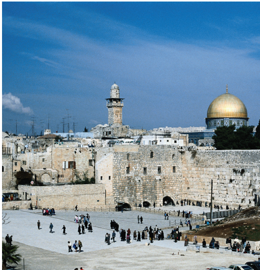
Devout Jews pray at Jerusalem's Western Wall.