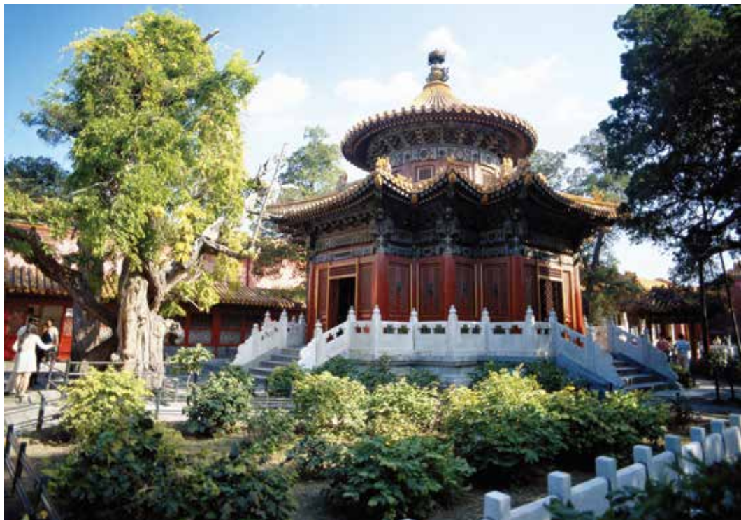
Tour the historic Forbidden City complex on Day 3.

Buddhist temples. After lunch we visit the museum housing the renowned Terra Cotta Warriors, the more than 7,000 life-sized soldiers created to guard China's first emperor in the afterlife. We see these astounding pieces, each with an individually sculpted face, standing in military formation in three separate vaults. The entire complex is now a UNESCO World Heritage site. B,L,D