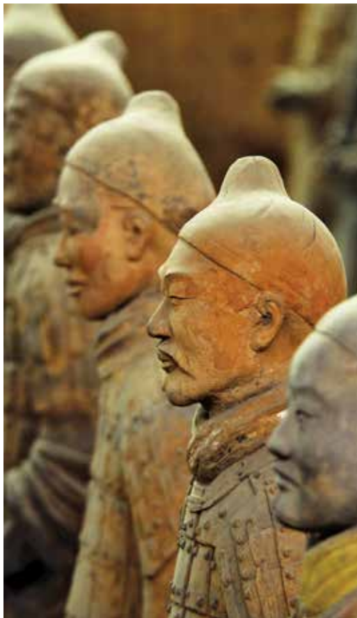
We view Xian’s amazing Terra Cotta Warriors on Day 7.