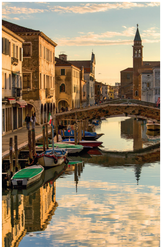
Our tour ends in timeless Venice.