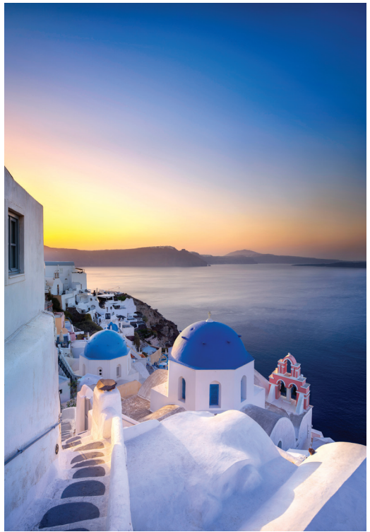
We spend two nights in idyllic Santorini.