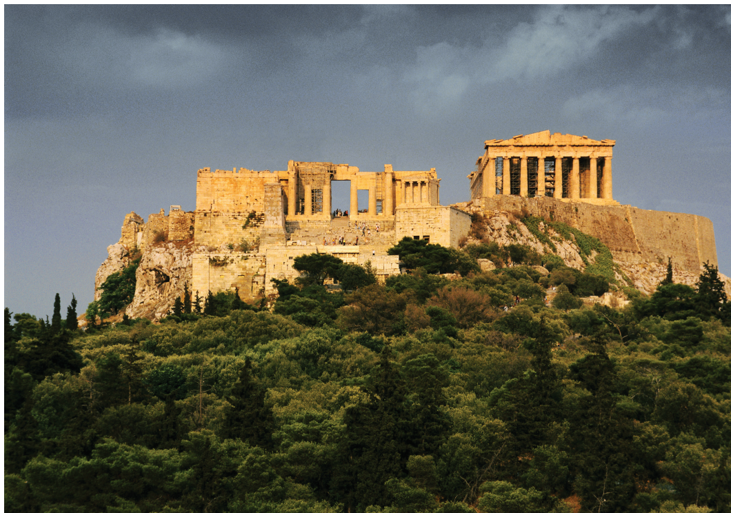
Athens' famed Acropolis and its Parthenon, which we visit on Day 3

our resort hotel on the Peloponnesian coast and dine there tonight. B,L,D