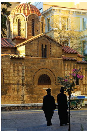
Athens street scene

Day 12: Santorini Today we tour Santorini’s archaeological site of Akrotiri, a Bronze Age Minoan location that was abandoned in the 17 th century BCE