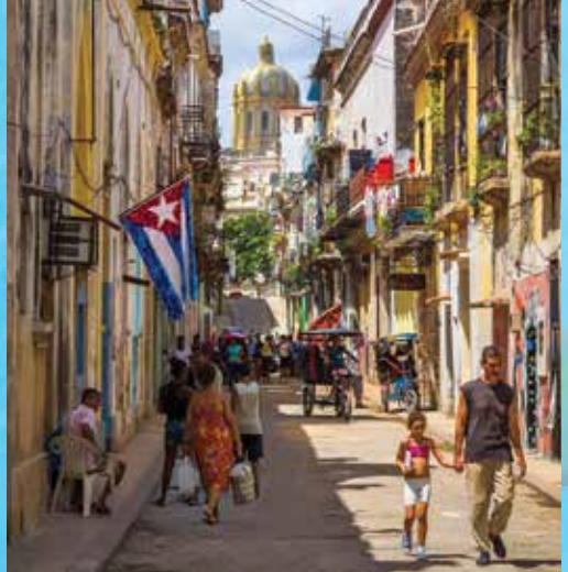
Lively Brasil Street in Old Havana.

Visit the UNESCO World Heritage-designated Castillo San Pedro de la Roca ( El Morro ), a 17 th -century fortress built to protect Santiago de Cuba Bay.