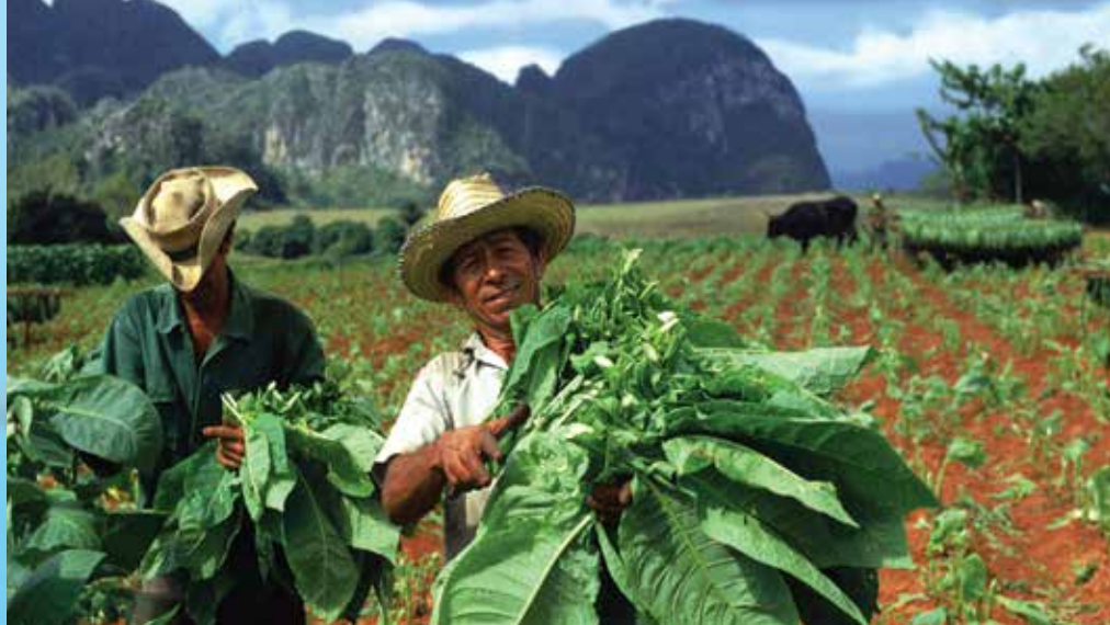
Farmers grow much of the world's premium cigar tobacco in the fertile Viñales Valley, a UNESCO World Heritage site, in the agricultural province of Pinar del Río.