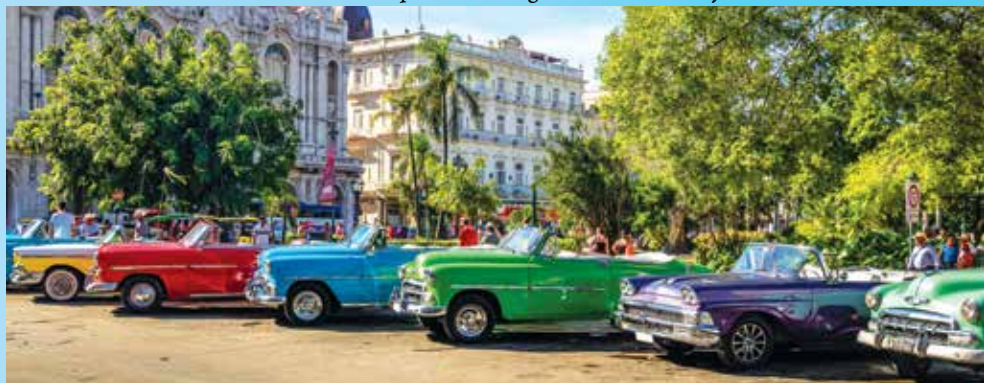
Photo below: Havana is ornamented with polished vintage cars and timelessly rendered architecture.

Cover photo: Admire Havana's stately 20 th -century monument Capitolio Nacional.