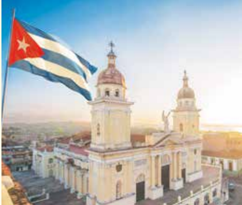
Santiago de Cuba celebrates a dynamic coalescence of Spanish Colonial and Afro-Cuban influences.

RESPONSIBILITY: Gohagan & Company, the sponsoring associations/ organizations, and its and their employees, shareholders, subsidiaries, affiliates, officers, directors or trustees, successors, and assigns (collectively "Gohagan"), do not own or operate any entity which is to or does provide goods or services for your trip including, for example, lodging facilities, airline, vessel, or other transportation companies, guides or guide services, local ground operators, providers or organizers of optional excursions, food service or entertainment providers, etc. All such persons and entities are independent contractors. As a result, Gohagan is not liable for any negligent or willful act or failure to act of any such person or entity or of any other third party.