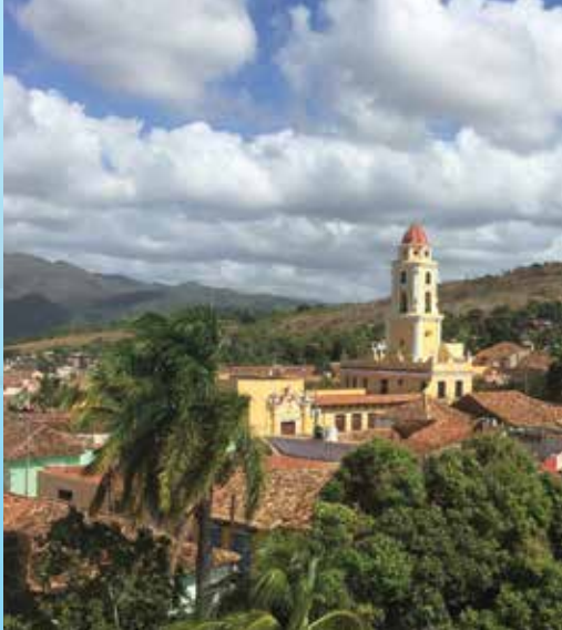
The historic plazas of Trinidad are neighbored by a topography of mountain ranges and coastal plains.

Travel to Santa Clara, the gateway to Cuba's historically and agriculturally rich region shaped by its prestigious university and grand colonial theater. The site of the Cuban Revolution's last battle, Santa Clara has long been associated with Ernesto “Che” Guevara; see his impressive monument and explore the comprehensive History Museum of the Revolution.