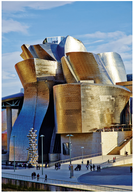
We visit Bilbao’s iconic Guggenheim Museum.