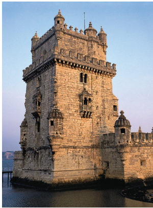
Lisbon’s Belem Tower

Day 15: Barcelona This morning’s city tour features Barri Gòtic (Gothic Quarter), a maze of medieval