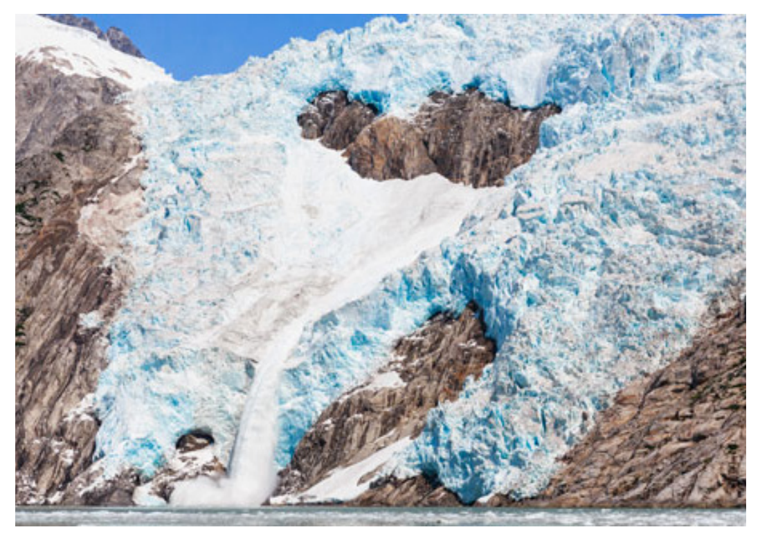
We see glaciers, wildlife, and marine life on a cruise to explore rugged Kenai Fjords National Park on Day 9.

We return to the lodge for lunch followed by an afternoon at leisure; perhaps to do some hiking or take an optional rafting excursion. This evening we reconvene for dinner and a lively show at the Denali Dinner Theater housed in an authentic log cabin. B,D