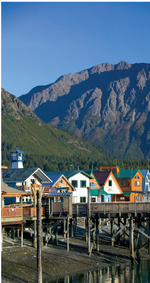
Colorful buildings overlook Seward's harbor.