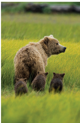
We may see grizzlies while on tour.

Day 9: Seward One of Alaska’s most scenic communities, Seward features a bustling harbor, inviting shops, and plenty of outdoor activities. The city also serves as the gateway to Kenai Fjords National Park, a 600,000-acre preserve comprising rocky peninsulas, long fjords, primeval glaciers, and tranquil bays and coves. We explore this rugged park today on a glacier and wildlife cruise. On board, we get up close to one of Kenai’s many glaciers and keep an eye out for some of the park’s diverse array of mammals and marine life, including bears, mountain goats, moose, otters, porpoises, sea lions, harbor seals, and whales. We enjoy lunch onboard before returning to Seward, where the remainder of the day is free for independent exploration and dinner on our own. B,L