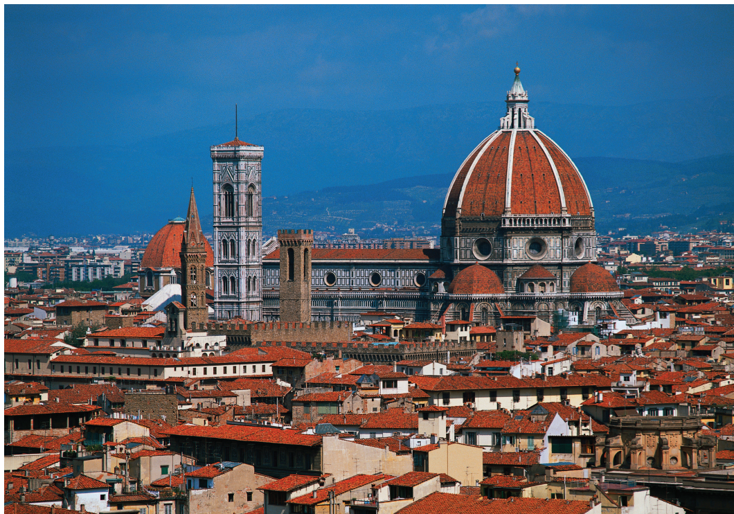
The Baptistry (l) and Duomo (r) rise above Florence's rooftops.