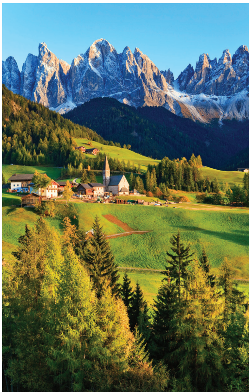
We enjoy stunning scenery in the South Tyrol.