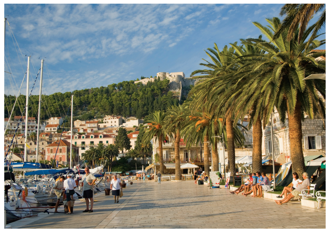
Hvar Town's palm-lined harborside promenade

Day 7: Opatija/Istrian Peninsula Today's tour of the Istrian Peninsula reveals the multicultural roots of this alluring spit of land jutting into the Adriatic. At various times a vassal of Venice, the first Austro-Hungarian Empire, Fascist Italy, the Yugoslav Federation, and finally, Croatia, Istra, as it is known, boasts an interesting history, mild Mediterranean climate, lovely scenery, and good wines. Our first stop is in the port of Pula, where we visit the well-preserved remains of a Roman amphitheater (c. 177 CE). Next is Rovinj, a charming old Venetian port where we are free to explore on our own and perhaps enjoy lunch at an outdoor café. After returning to Opatija late this afternoon, we dine together tonight at a local restaurant. B , D