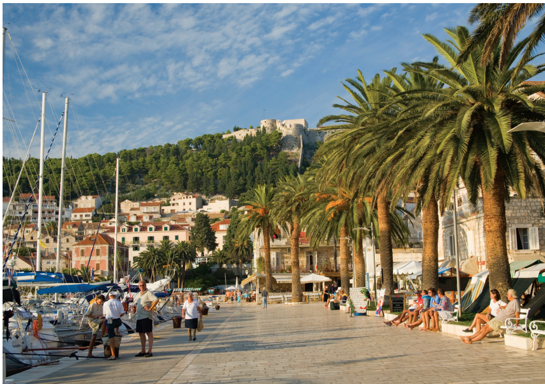
Hvar Town's palm-lined harborside promenade

Day 7: Opatija/Istrian Peninsula Today's tour of the Istrian Peninsula reveals the multicultural roots of this alluring spit of land jutting into the Adriatic. At various times a vassal of Venice, the first Austro-Hungarian Empire, Fascist Italy, the Yugoslav Federation, and finally, Croatia, Istra, as it is known, boasts an interesting history, mild Mediterranean climate, lovely scenery, and good wines. Our first stop is in the port of Pula, where we visit the well-preserved remains of a Roman amphitheater (c. 177 CE). Next is Rovinj, a charming old Venetian port where we are free to explore on our own and perhaps enjoy lunch at an outdoor café. After returning to Opatija late this afternoon, we dine together tonight at a local restaurant. B,D