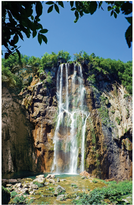
Waterfall at Plitvice Lakes