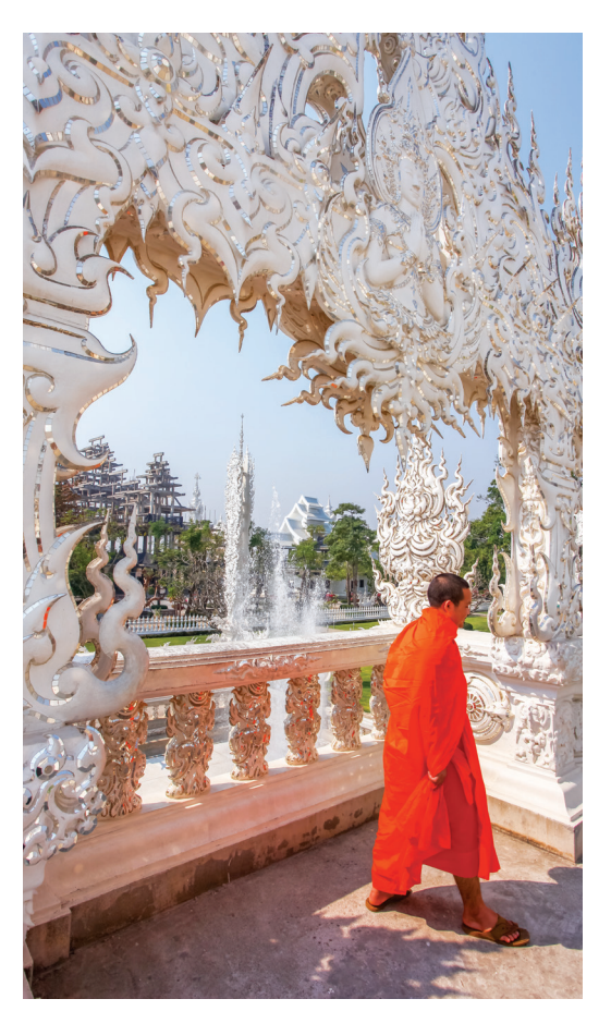
We tour the contemporary "White Temple" on Day 11.