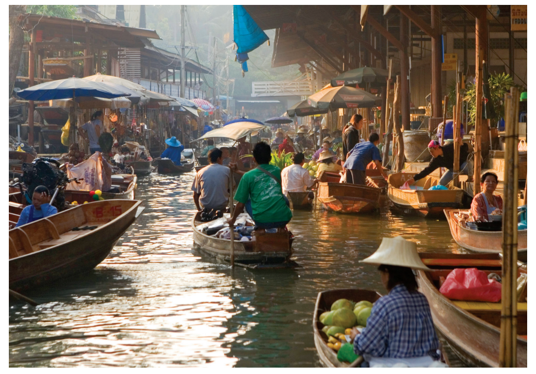
Visit the Damnoen Saduak Floating Market on Day 6.

sample some of the local goods and tropical fruits, and learn about the important role rice plays in Thai life. Before returning to our hotel, we see the wooden bridge of the Tham Krasae Death Railway, and stop at the Cemetery of the Allied Prisoners of War, burial site of WWII prisoners who perished as forced laborers on the construction of the notorious Burma Railway. B , L , D