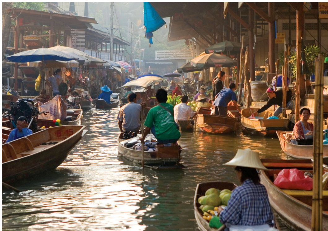
Visit the Damnoen Saduak Floating Market on Day 6.

sample some of the local goods and tropical fruits, and learn about the important role rice plays in Thai life. Before returning to our hotel, we see the wooden bridge of the Tham Krasae Death Railway, and stop at the Cemetery of the Allied Prisoners of War, burial site of WWII prisoners who perished as forced laborers on the construction of the notorious Burma Railway. B,L,D