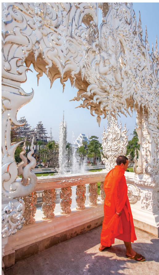
We tour the contemporary “White Temple” on Day 11.