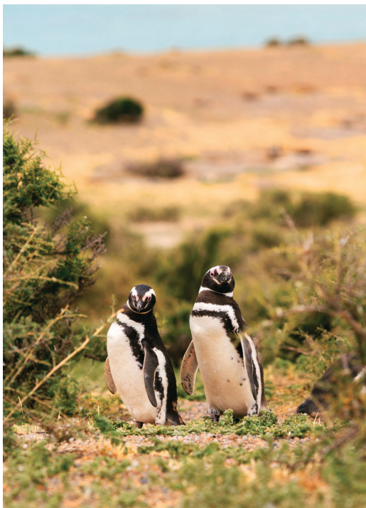
On Day 7, we see Magellanic penguins on Magdalena Island.

Day 17: Arrive U.S. We arrive in the U.S. this morning and connect with our return flights home.