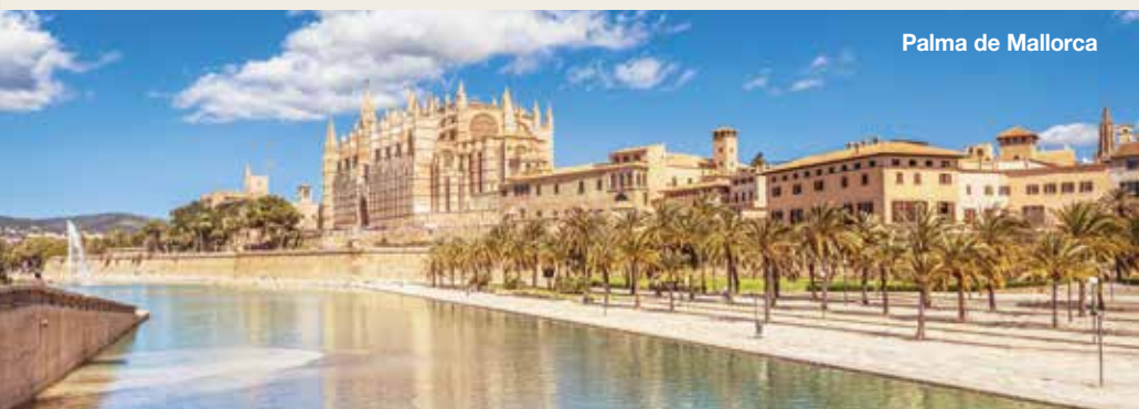
Palma de Mallorca