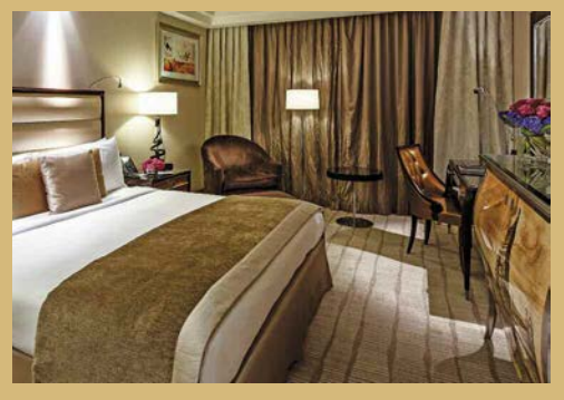
INTERCONTINENTAL MOSCOW TVERSKAYA | MOSCOW