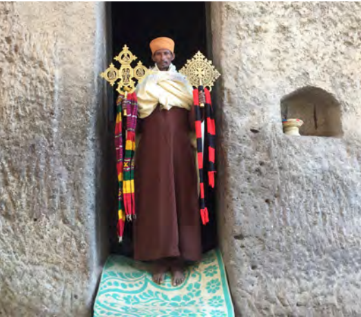
Priest at Asheton Mariam Monastery in Lalibela