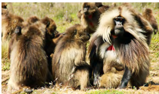
A group of gelada baboons high in the Simien Mountains