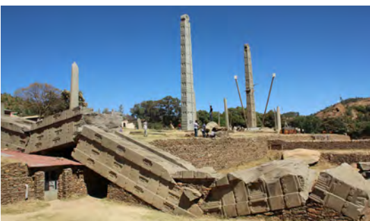
Ruins of Axum