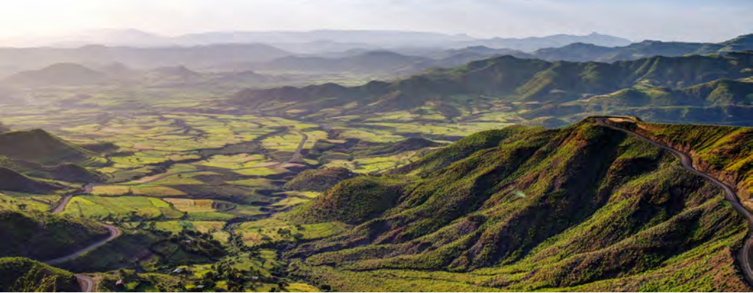
Simien Mountains and valley around Lalibela