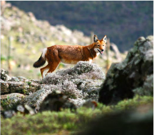
Ethiopian wolf in the Simien Mountains