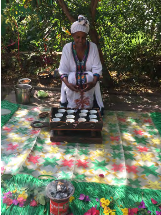
Traditional Ethiopian coffee ceremony