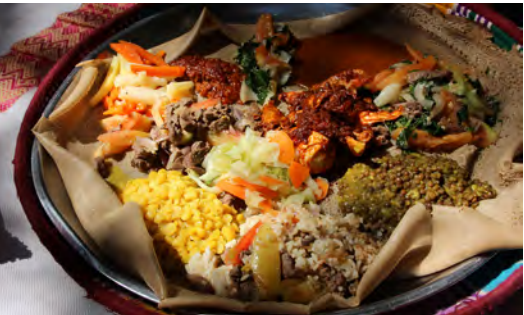
Traditional Ethiopian cuisine served on injera bread

“Ethiopia always has a special place in my imagination and the prospect of visiting Ethiopia attracted me more strongly than a trip to France, England, and America combined. I felt I would be visiting my own genesis, unearthing the roots of what made me an African.”