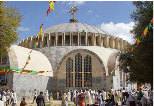
Church of Mariam in Axum