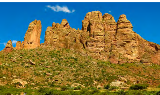
The beautiful landscape of the Gheralta region

Ethiopian children do not share a surname with their parents, instead take their father's first name as their last name.