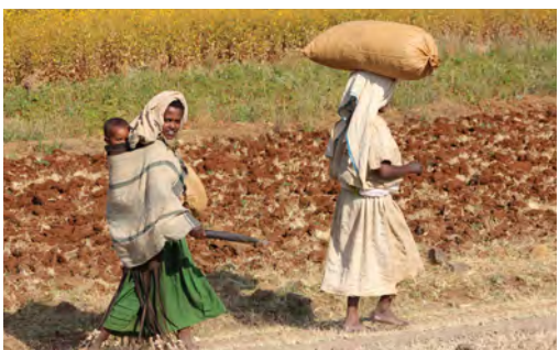
Ethiopian locals along the side of the road en route to Gondar