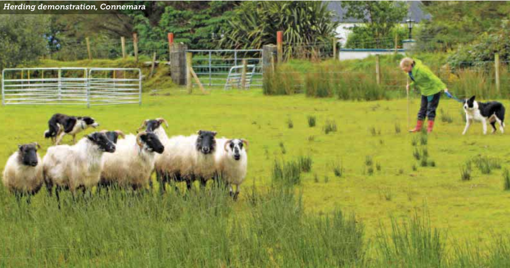
Herding demonstration, Connemara