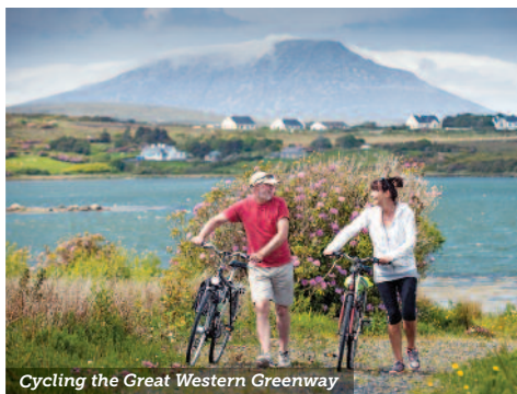
Cycling the Great Western Greenway

starkly beautiful landscape shaped by ancient glaciers that Oscar Wilde described as "savage." See Croagh Patrick Mountain, where St. Patrick is said to have fasted for 40 days in the fifth century. Visit the family-owned Glen Keen farm for a sheepdog demonstration and chat about sheep farming with a member of the family. Continue to Kylemore Abbey, a romantic, 19th-century castle overlooking a beautiful lake, where you will tour the home and gardens. Originally built by a wealthy Londoner for his beloved wife, the castle was later purchased by Benedictine nuns in 1920. Conclude your day with a trip to the delightful town of Clifden and return via scenic Inagh Valley.