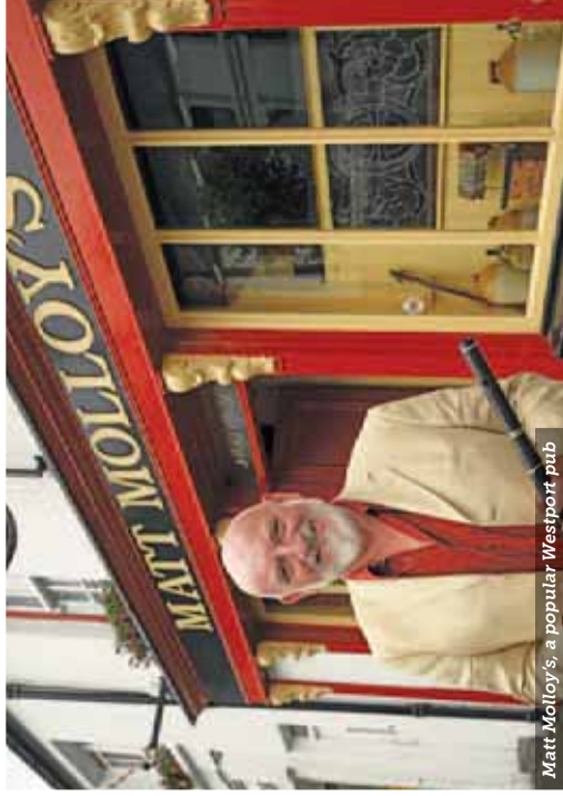
Matt Molloy's, a popular Westport pub