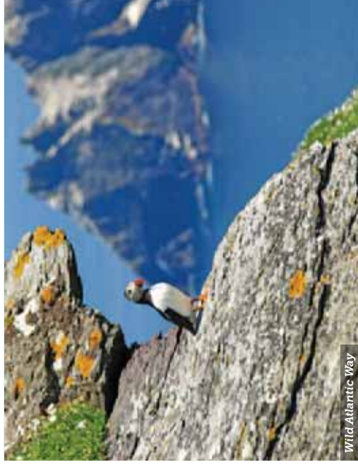
Wild Atlantic Way