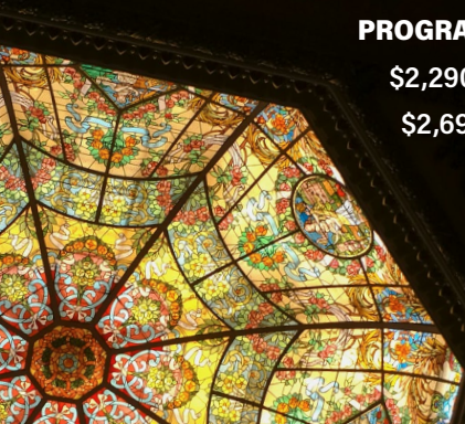
Interior dome in the Teatro Colón

PROGRAM RATES per person $2,290 double occupancy $2,690 single occupancy supplement