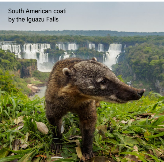
South American coati by the Iguazu Falls