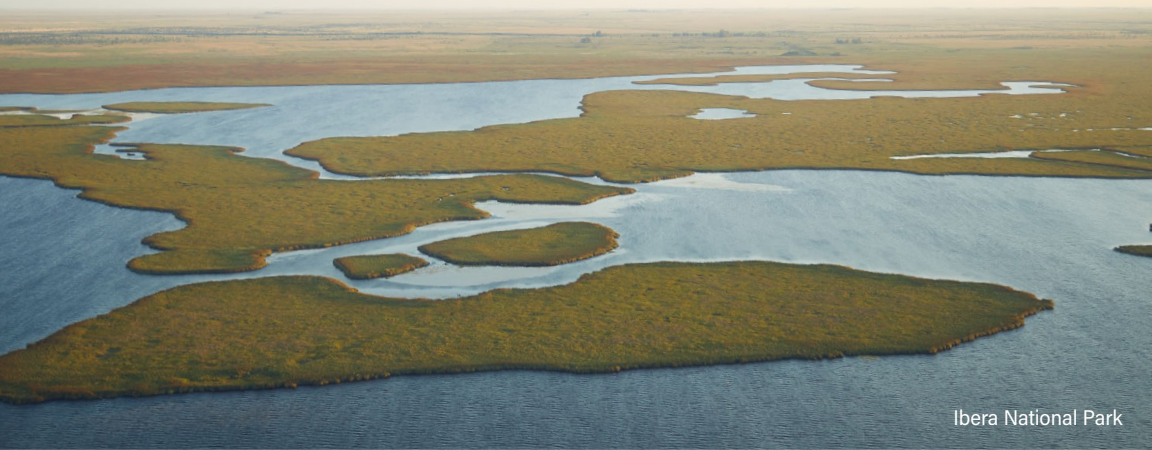
Ibera National Park