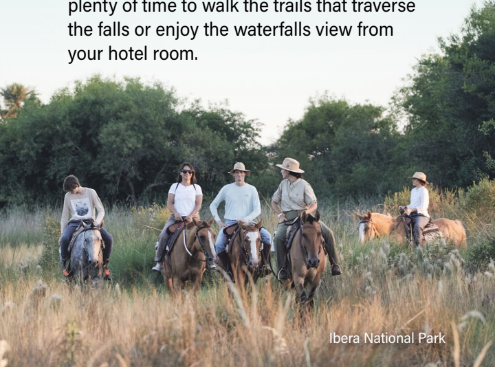
Ibera National Park