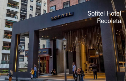
Sofitel Hotel Recoleta