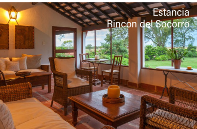
Estancia Rincon del Socorro