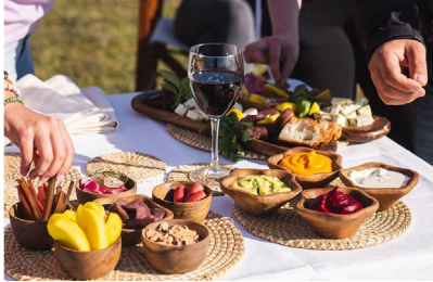
Gran Melia Iguazu Hotel