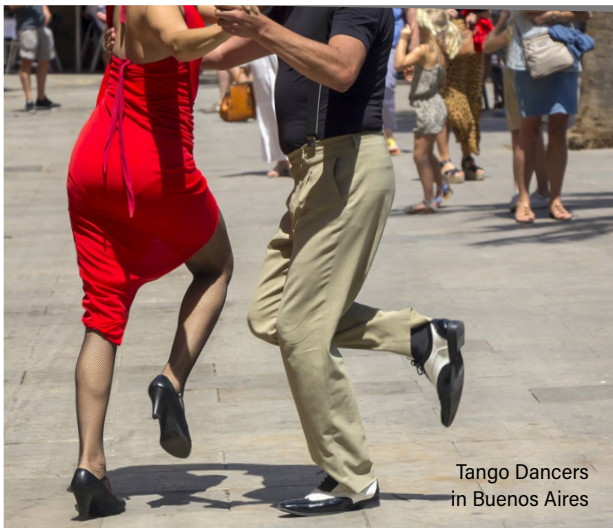
Tango Dancers in Buenos Aires