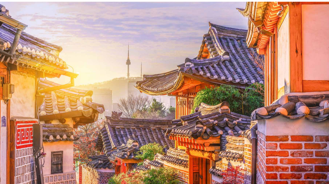
BUKCHON HANOK VILLAGE

THE PLAZA SEOUL, AUTOGRAPH COLLECTION (B,L,D)