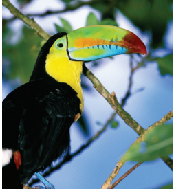
A colorful toucan

bird- and wildlife, including monkeys, iguanas, and crocodiles. After lunch together we return to our hotel mid-afternoon, with the remainder of the day at leisure along one of Costa Rica’s most beautiful Pacific Coast settings. B,L