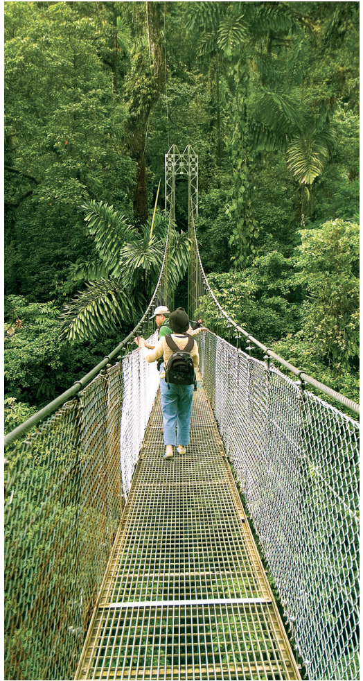
Enjoy treetop rainforest views from Arenal’s Sky Walk.