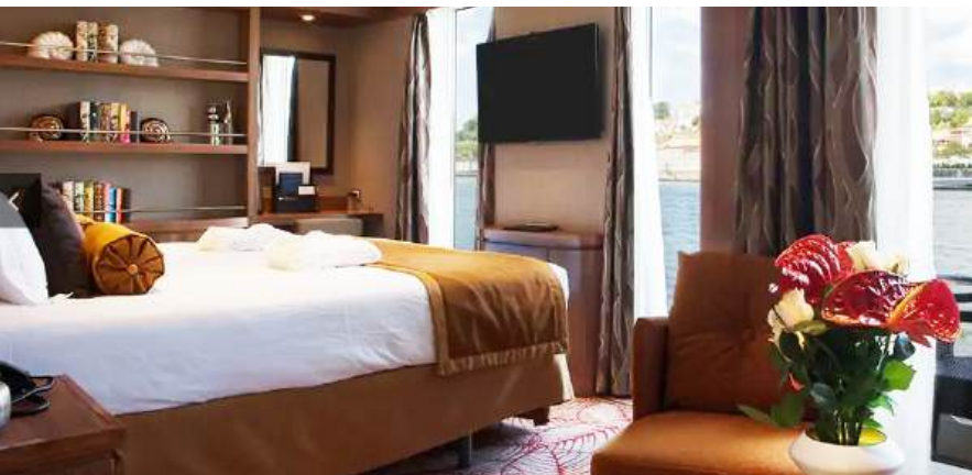
AmaSintra (top), Panoramic Lounge (center), and Suite (above)