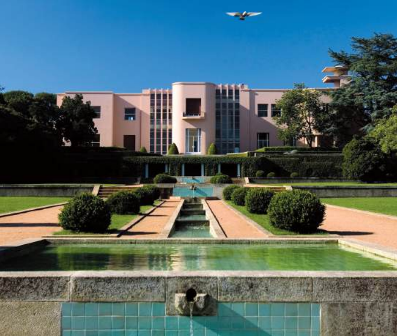
Fundação de Serralves, Porto, Portugal