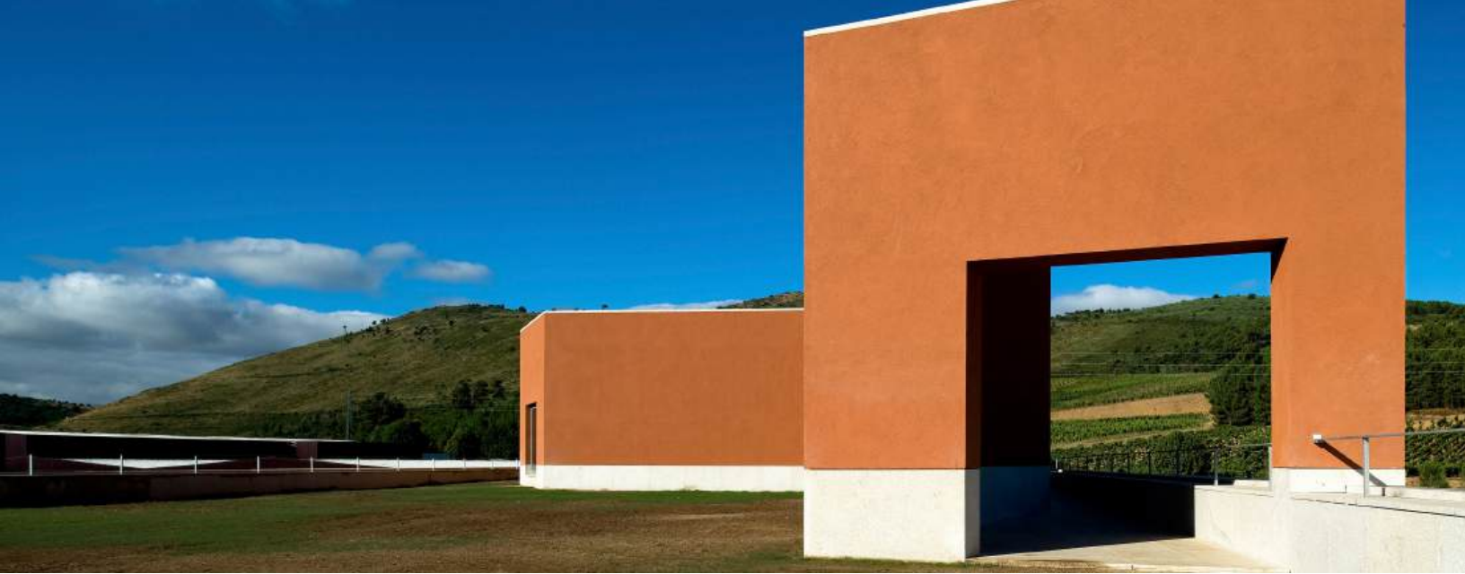
Quinta do Portal