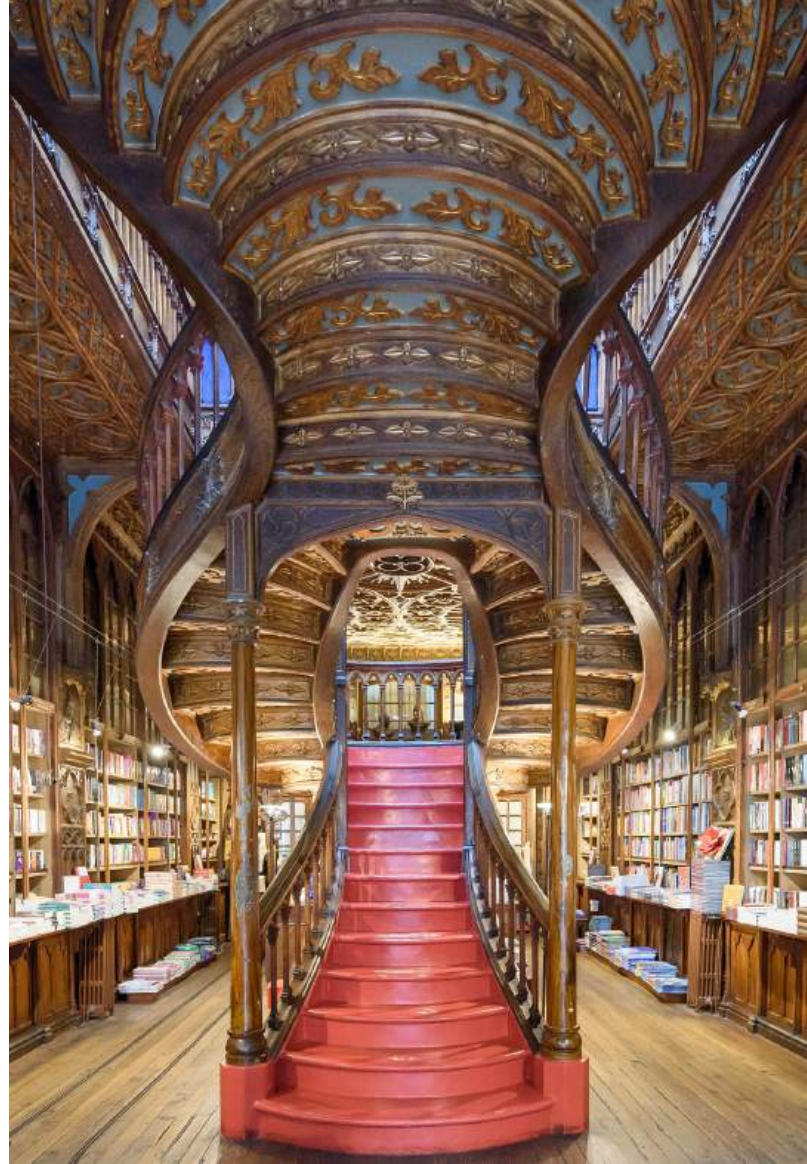
Photos clockwise from top left: Santuário de Nossa Senhora dos Remédios, Lamego; Livraria Lello, Porto; and Casa da Música, Porto, Portugal