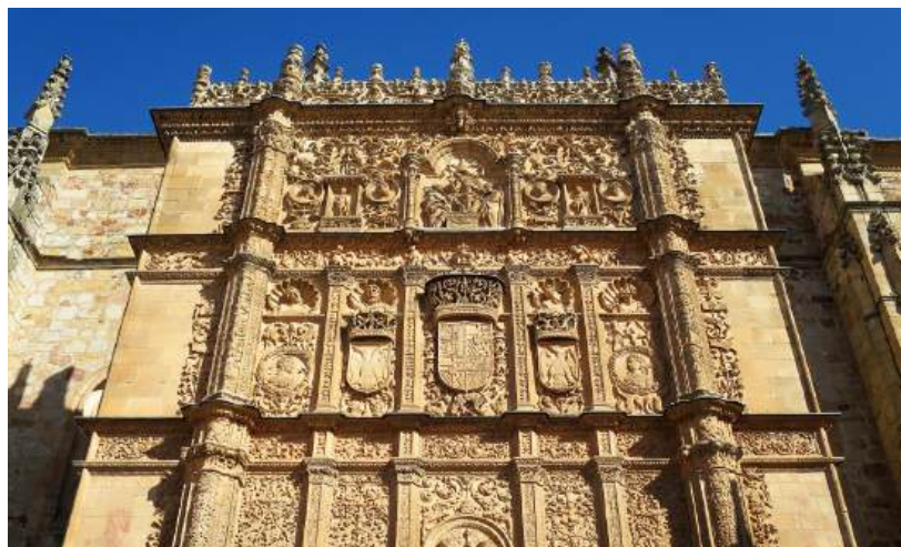
Universidad de Salamanca, Salamanca, Spain

Spend the morning cruising through the picturesque Pinhão Valley , near where the Rio Pinhão meets the Douro. Then transfer to Sabrosa , known as the birthplace of Portuguese explorer Ferdinand Magellan, for a visit to Quinta do Portal , a family-owned boutique winery with centuries-old vineyards. Learn about their commitment to sustainability, including their unique way of planting and the installation of photovoltaic panels to produce half of the winery's electricity. You will also tour the modern cellars designed by Álvaro Siza and enjoy a wine tasting. B,L,D