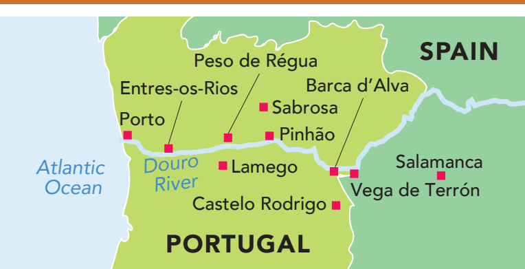
Map of the region