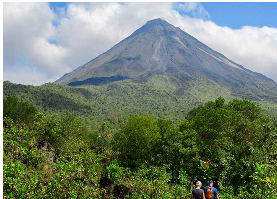
ARENAL NATIONAL PARK