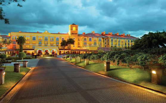
MARRIOTT HACIENDA BELEN, SAN JOSE