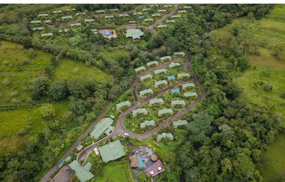
ARENAL MANOA RESORT, ARENAL

2 nights El Establo Mountain Hotel, Monteverde