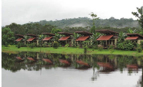
MAQUENQUE ECO LODGE, BOCA TAPADA