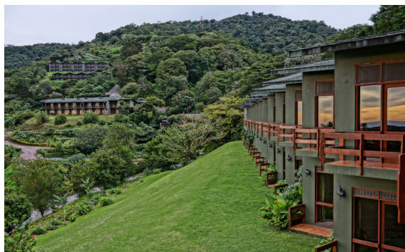
EL ESTABLO MOUNTAIN HOTEL, MONTEVERDE

Optional upgrade to Deluxe Treehouse, Maquenque $500 per room